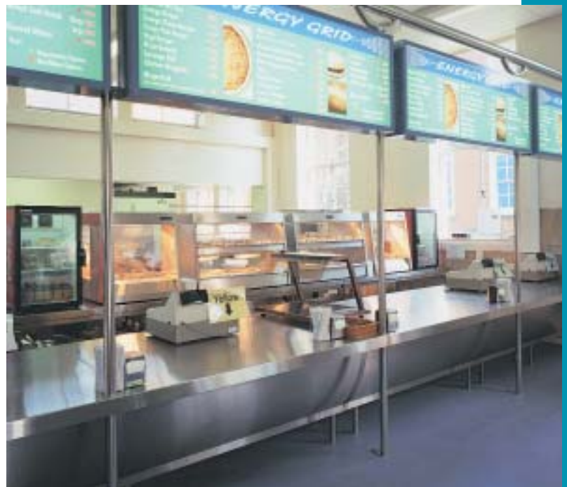
School fast food counter in stainless steel, complete with cladding, preparation tables and stainless steel tubular signage support framework.