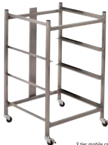
3 tier mobile rack (castors optional).