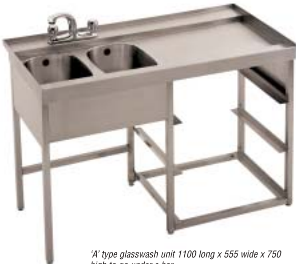
'A' type glasswash unit 1100 long x 555 wide x 750 high to go under a bar.