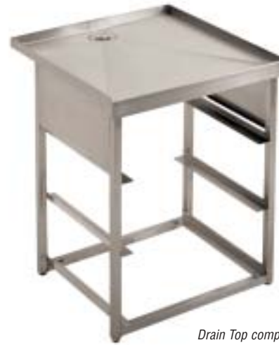
Drain Top complete with basket rack.

Bartender units can be designed and manufactured to client requirements.