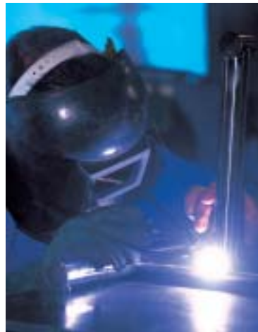
State-of-the-art production technology.