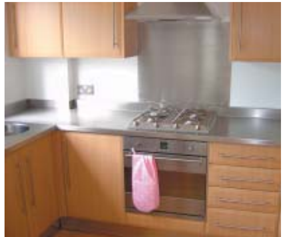
One of our projects.