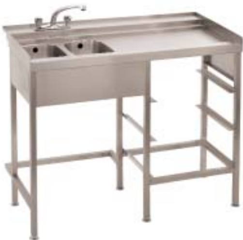
'B1' type glasswash unit 1250 long x 650 wide x 1000 high supplied with basket rack or clear under drainer for machine.