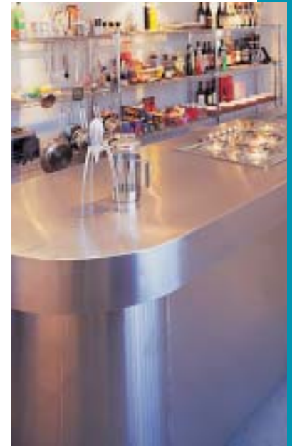
Curved stainless steel worktop with recess for a chopping board and hob by others.