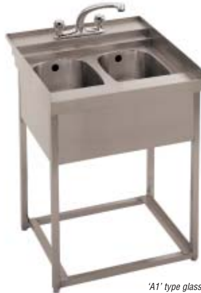
'A1' type glasswash sink complete with 1 pair of runners to take basket.