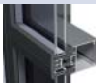
CW 60-DRL INSULATED