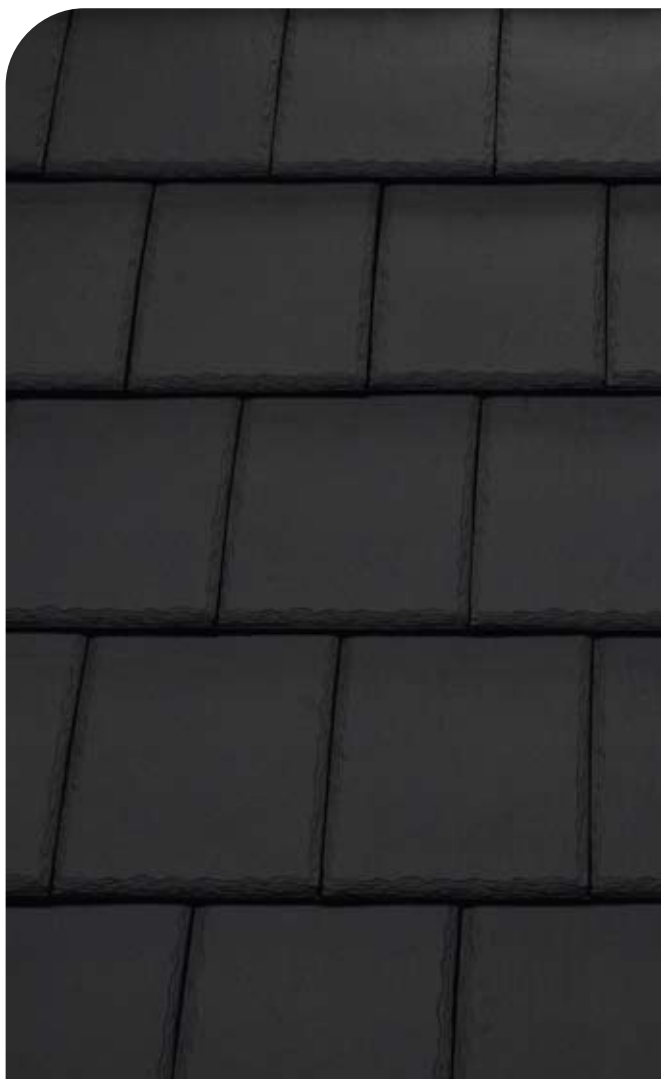
Rivius in Antique Slate