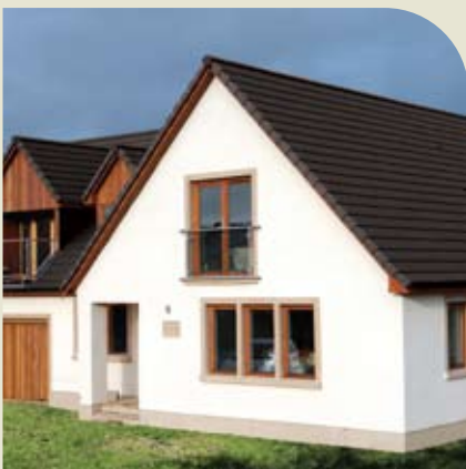
Rivius shown with Multiverge

Since there is no need for on-site sorting, grading and holing, or any requirement for special slates at the eaves or ridge due to the fact that Rivius and Balmoral are designed with a variable gauge; the installation benefits of these unique and entirely natural slate alternatives becomes clear. On-site experience shows that installation times are in line with those of large format concrete tiles – and offer a considerable saving over natural quarried slate or man-made fibre cement products.