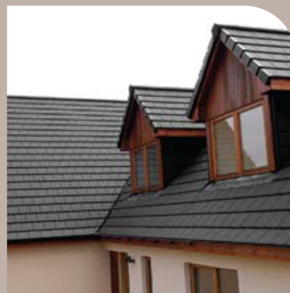
Rivius shown with Multiverge dry verge system