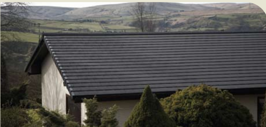
Rivius shown with Multiverge dry verge system

With over 100 years' experience manufacturing clay tiles for the UK climate, Sandtoft is able to offer a 60 year durability guarantee for Rivius. Like all Sandtoft clay products Rivius is completely frost resistant and routinely tested to four times the current UK standard for frost.