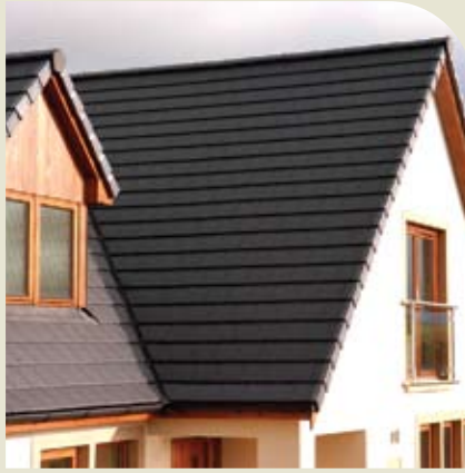
Rivius shown with Multiverge dry verge system