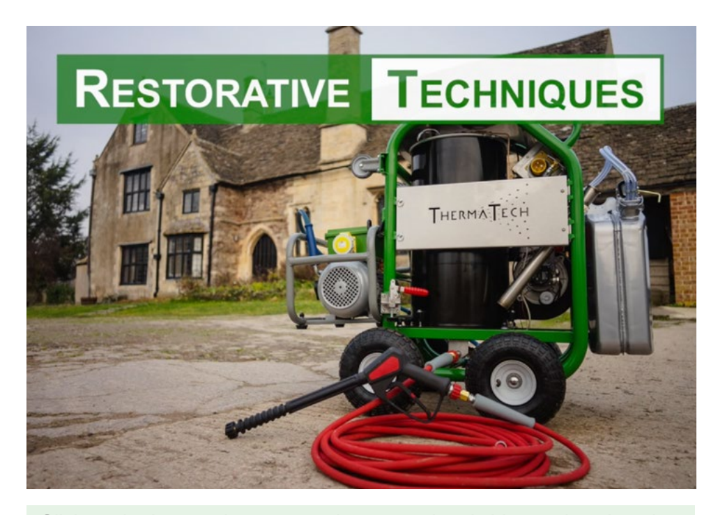
Click on the image above see a demonstrational video and explanation