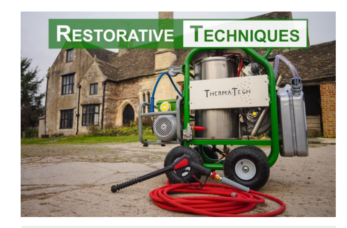
Click on the image above see a demonstrational video and explanation