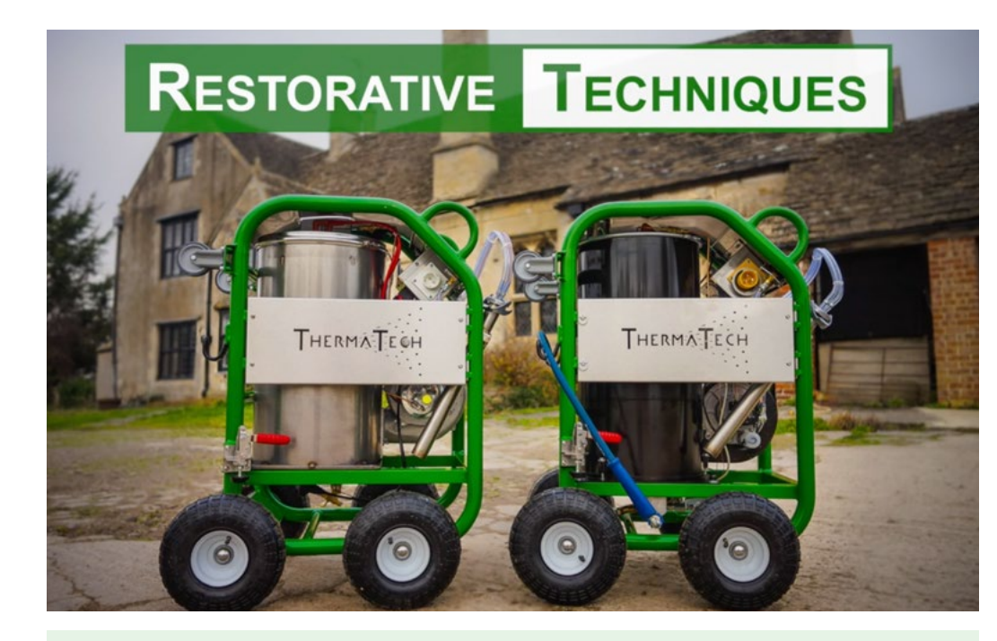
Click on the image above see a demonstrational video and explanation

By using high efficiency motors and minimal water, it yields positive results for COSHH and REACH in safety and environmental risk assessments.