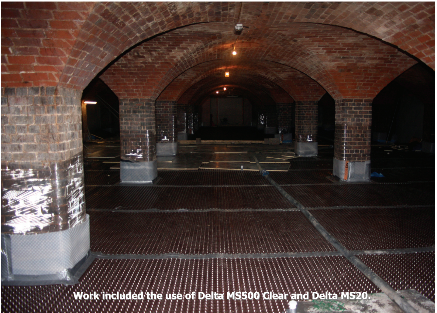
Work included the use of Delta MS500 Clear and Delta MS20.

The result is a substantial area that will be enjoyed by the people of Worcester for decades to come.