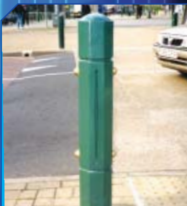
PCA08 Caernarfon H 990 W 160 Octagonal