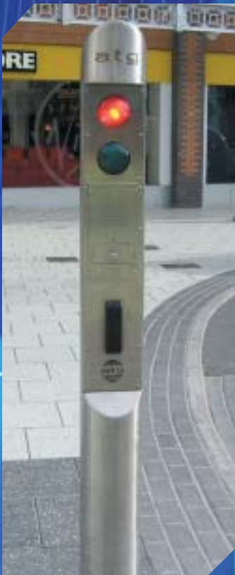
Traffic indicator columns ensure safe passage for authorized vehicles

Automatic bollard systems allow flexible solutions for Pedestrianisation systems in towns and cities throughout the UK.