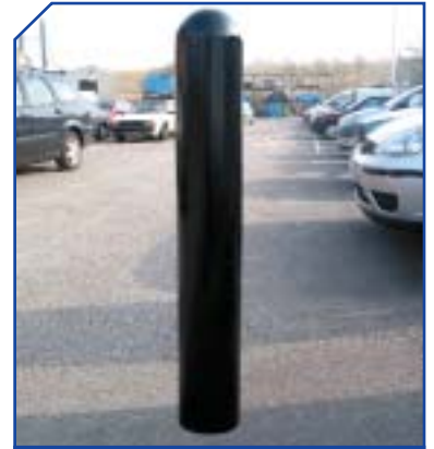
PBT01 Braintree H 1100 Ø 170