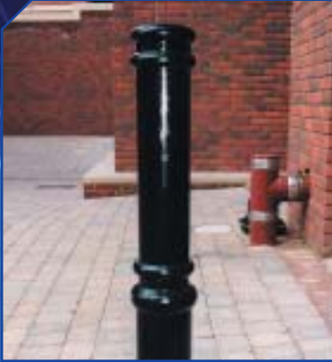
PLL01 Llangefni H 1050 Ø 135