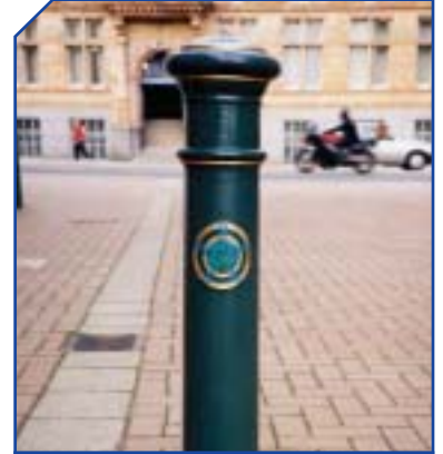
PMA01 Manchester H 940 Ø 210