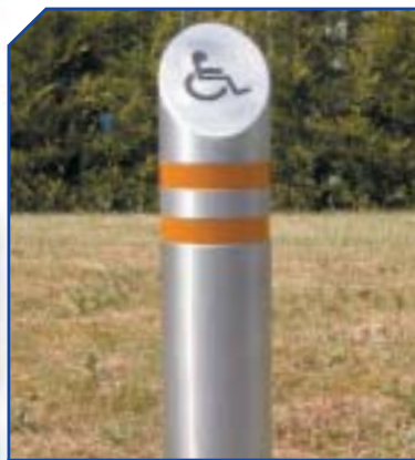
OPTI 114 sloping top