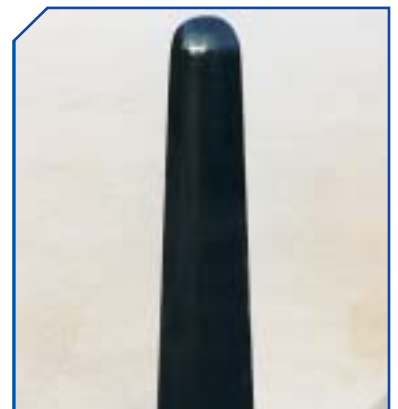
PWA02 Wirral H 1000 Ø 185