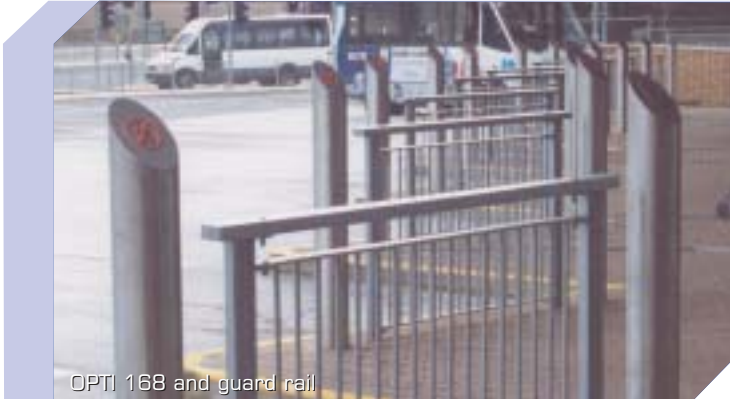
OPTI 168 and guard rail

A range of fixed stainless steel furniture available in various grades, complements the Static Bollards available from ATG Access. Please enquire for further details.