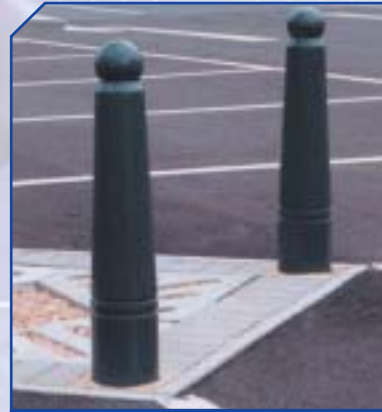
PED01 Edinburgh H 735 Ø 150