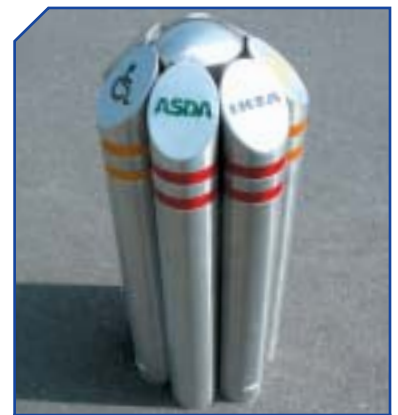
Customised logo designs