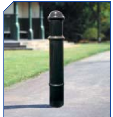
PCA05 Camberwell H 1140 Ø 170