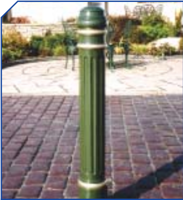
PCH05 Chilsehurst H 1030 Ø 150