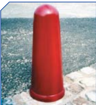
PHA02 Harrogate H 600 Ø 220