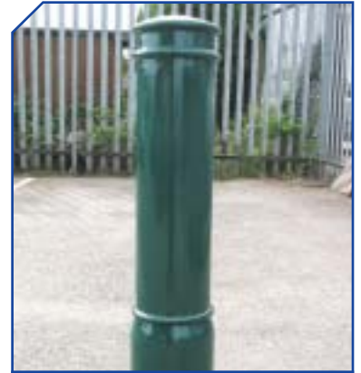
PAI01 Airdrie H 1090 Ø 205