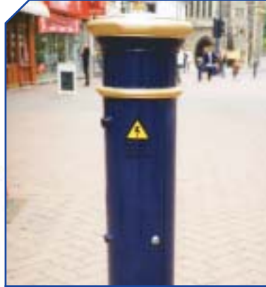
PMA01-SB Manchester H 1070 Ø 288