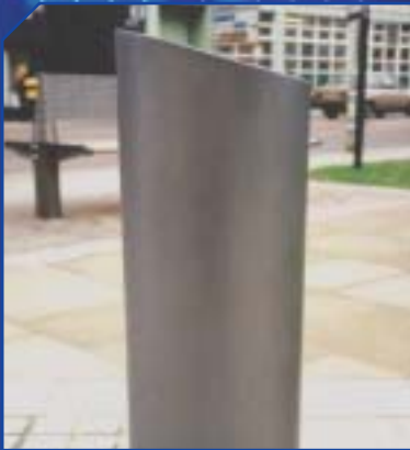
PMI02 Millennium H 840 250x150 Ellipse