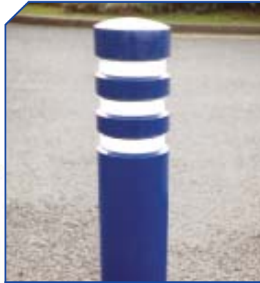
PAS01 Aspen H 800 Ø 145