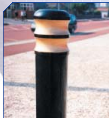
PL001 Lodge Green H 900 Ø 170