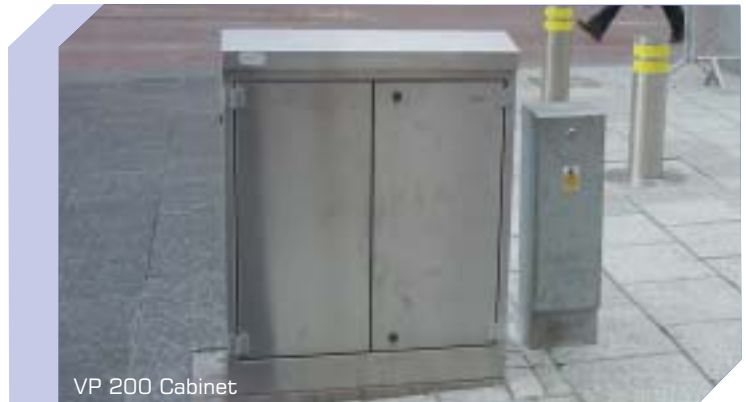
VP 200 Cabinet

A street cabinet houses the hydraulic power unit and system control equipment.