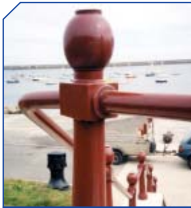
PEX04 Exley H 600 Ø 135