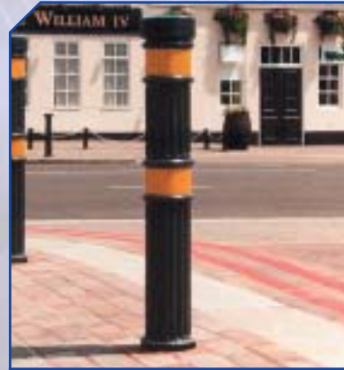
PCL01 Clapham H 900 Ø 150