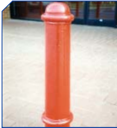
PDE01 Delavel H 800 Ø 185