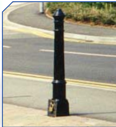
PCA03 Calne H 1125 Ø 140