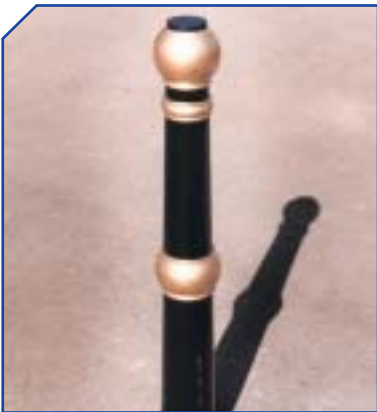
PEX05 Exeter H 1000 Ø 168