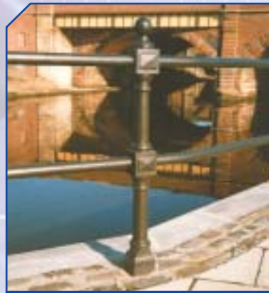
PHE02 Heritage H 1070 W 101 Square