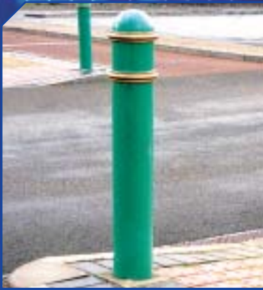
PAS08 Ashbourne H 900 Ø 140