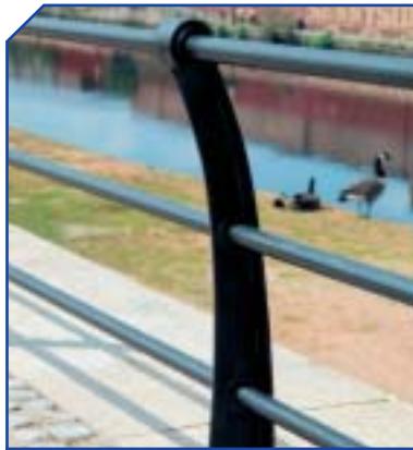
PQU10 Quinton H 1245