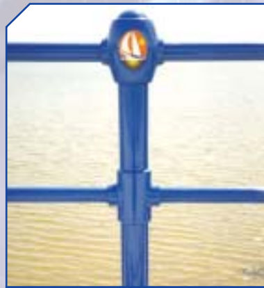
PPW03 Pwllheli H 1030 Ø 215