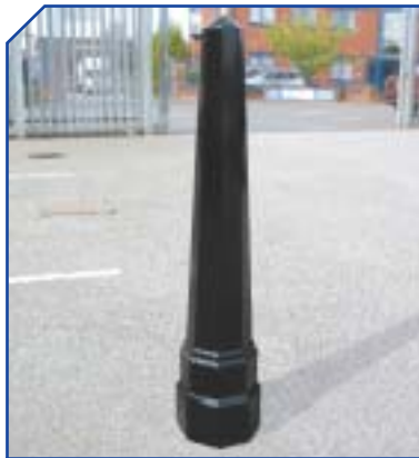
PGL01 Glaston H 790 W 200 Octagonal