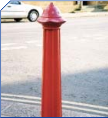
PDA02 Dalton H 950 Ø 210