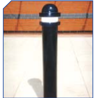
PRO01 Rochdale H 1000 Ø 175