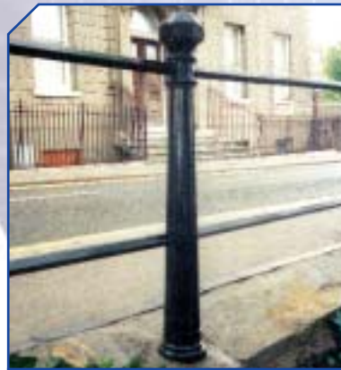
PRH02 Richmond Hill H 970 Ø 145