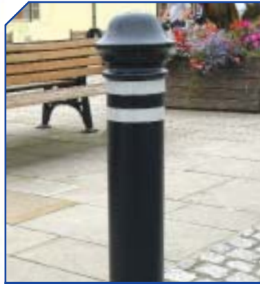
PBE01 Beaumaris H 950 Ø 170