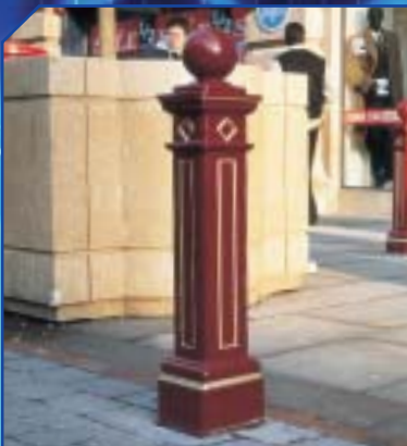
PST03 Stapleford H 1000 Ø 200