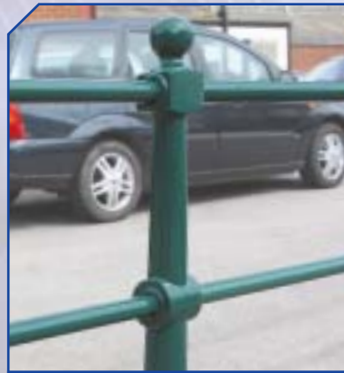
PBE03 Bellevue H 1050 Ø 135