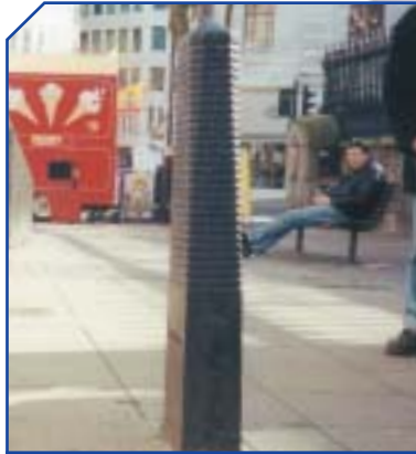
PCI01 Cittadel H 1050 W 250 D 140