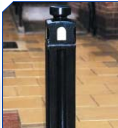
PST06 Staylbridge H 895 W 150 Square