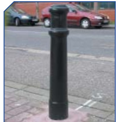
PSU01 Sunningdale H 900 Ø 148