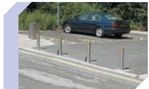
The AT Genie is a compact automatic bollard which can be used to control access for disabled parking bays.