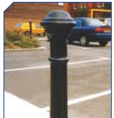
PCH04 Chetwynd H 1015 Ø 220