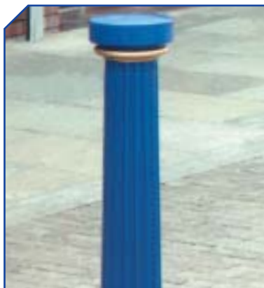
PHE01 Hexham H 900 Ø 200