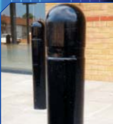
PTE03 Tebay H 1050 Ø 130