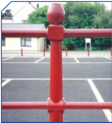
PEX02 Exley H 1150 Ø 138