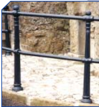
PAB01 Aberffraw H 1200 Ø 165