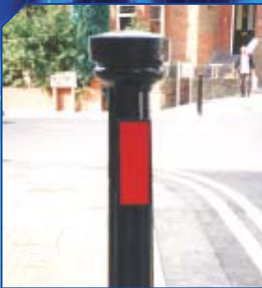
PCA02 Camden H 1100 Ø 192