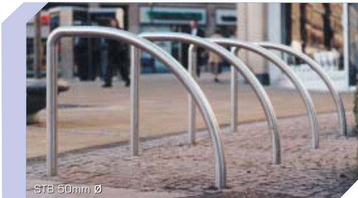
STB 50mm Ø

Individual items can be supplied to suit your application.