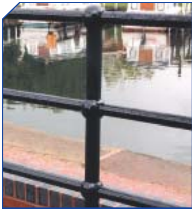
PAR01 Arran H 1133 Ø 120