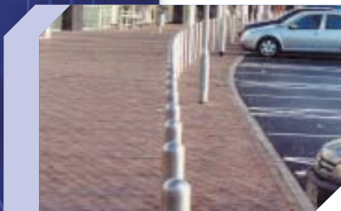
Static bollards provide additional permanent security

Clear and durable signage ensures the system operates efficiently and safely