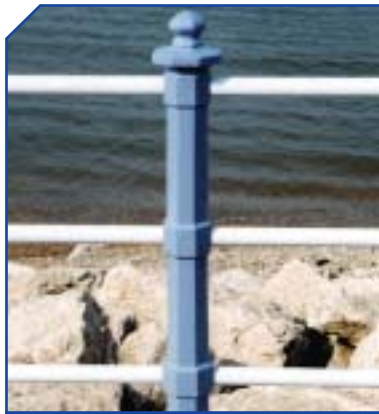
PM003 Morcambe H 1240 W 200 Octagonal