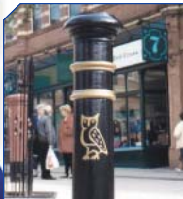
PWA01 Warrington H 940 Ø 185