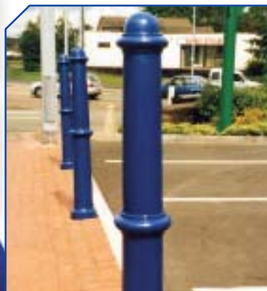
PCH02 Cheltenham H 985 Ø 163