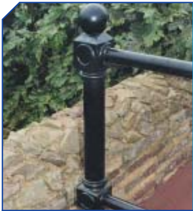
PQU01 Queensbury H 1100 Ø 100