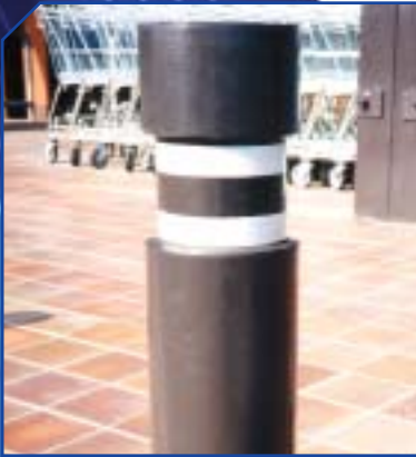
PAL01 Alpine H 800 Ø 168