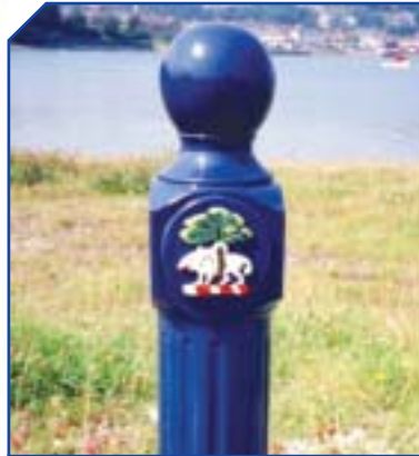
PPE01 Penrhyn H 900 Ø 130