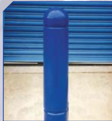
PGU01 Guna H 750 Ø 150