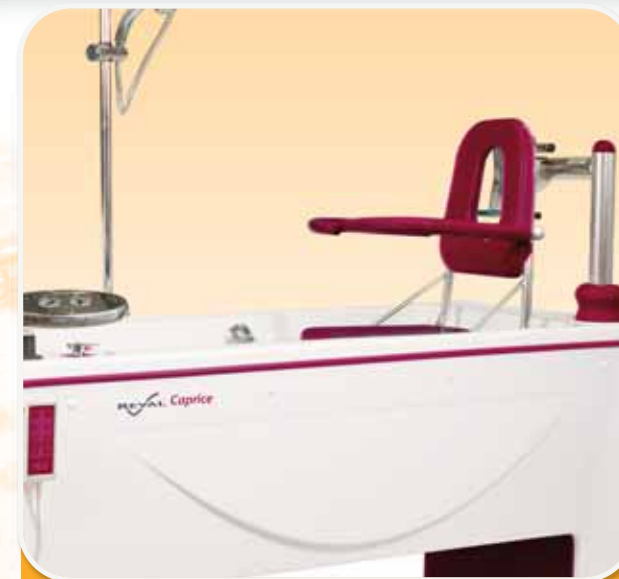
Integral hoist and seating system