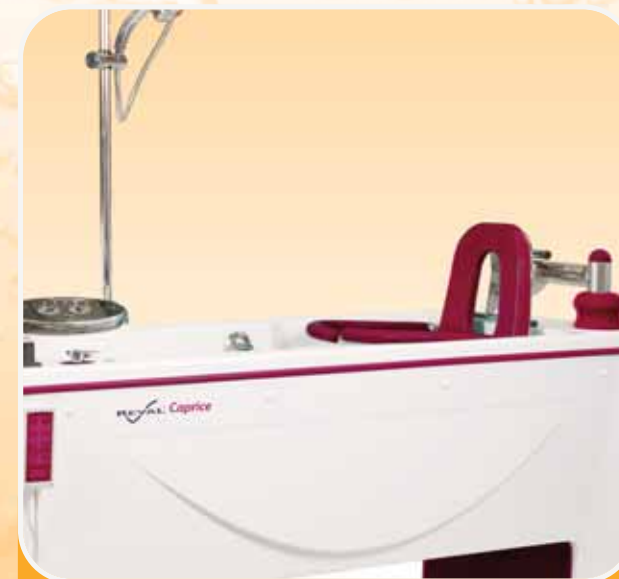
Integral hoist provides effortless transfers into baths