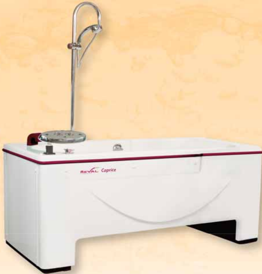
Fixed Height 7104.01 & 7104.02