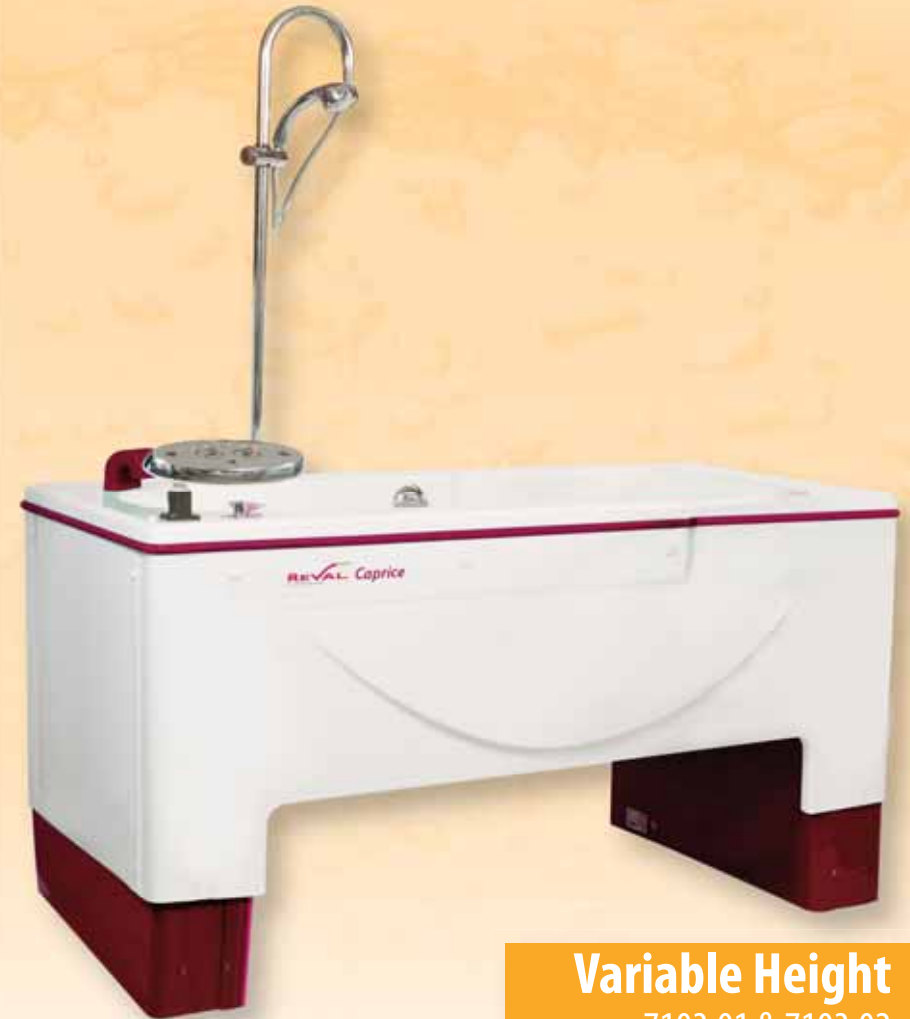
Variable Height 7103.01 & 7103.02

Caprice is made from high quality glass reinforced fibreglass for durability and is designed for industrial use, such as in hospitals and nursing homes. It comes complete with a 3 year warranty so you can be confident it provides long-term reliability and value for money for overall peace of mind.