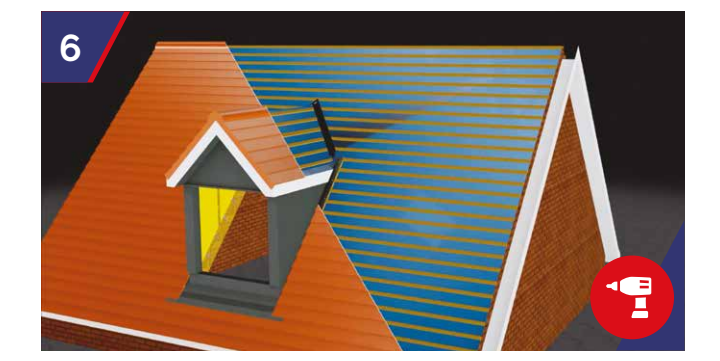
Battern out roof for tiling. Ensure the timber cocking fillet is installed creating a constant fall from the dormer onto the first row of tiles below the dormer. Using full and half tiles (tile and half preferred) set tiles within a maximum of 15mm from the side of the GRP dormer roof. This inside tile now covers the foam strip. Drill and nail all abutment tiles and adjacent tiles.