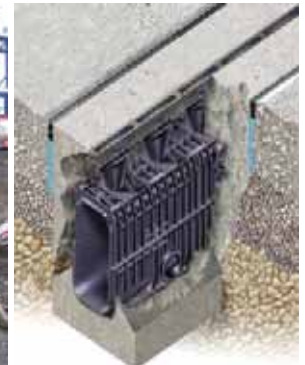
RECYFIX® HICAP® High Capacity drainage channel

County Durham based Hall Construction Services Ltd successfully won the design & build tender to carry out the civil engineering works at the Container Terminal. The Terminal's concreted area is over six hectares so effective surface water drainage was a major consideration to ensure efficient all-weather operation. Designed to resist the rigours of site work, two sizes of Hauraton channel were installed. 44 metres of RECYFIX® HICAP® 200 and 840 metres of HICAP® 680 installed in two runs. Each one metre unit was easily manipulated into position on site and no channel breakages were reported during the installation process. To further reduce installation times, end-of-run caps and pipe connection sockets were also supplied with other connection points moulded into the sides and bottom of each channel.