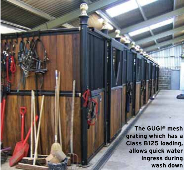
The GUGI® mesh grating which has a Class B125 loading, allows quick water ingress during wash down

A new stable block at South Dissington, Northumberland required a channel to drain the wash-down area. The grating needed to be made from a tough but non metallic material to provide a more sensitive surface for the horses' hooves.