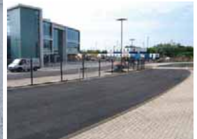
▲ FASERFIX® SUPER KS 100 with ductile iron gratings

The £27 million Northumbria Police area command headquarters in North Tyneside was officially opened and became fully operational in early November 2011.