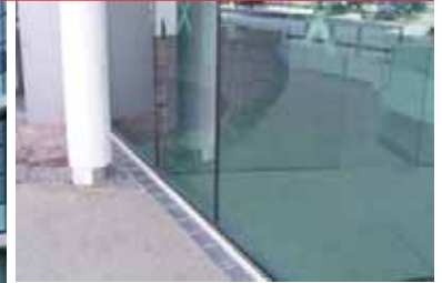
◀ FASERFIX® SUPER KS 100 with stainless steel gratings