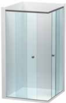
Two-sided corner application