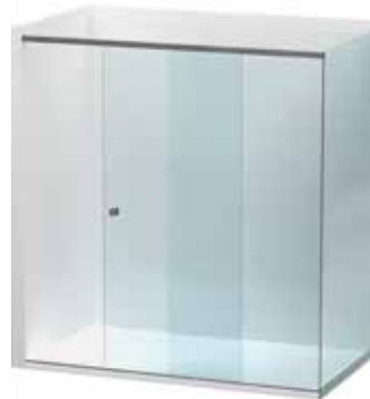
One-sided corner application