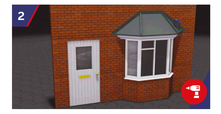
Using a 10mm drill bit, drill through the GRP Upstand into wall structure at a maximum of 450mm centres, to suit the StormFix 80 Fixing.