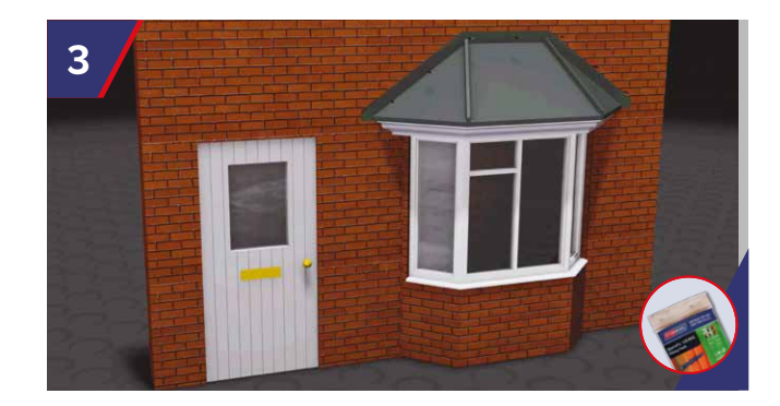
Insert StormFix Blue Frame Fixing Sleeve 80 into the drilled holes.

PLEASE DO NOT STAND OR REST ON THE ROOF DURING FIXING.