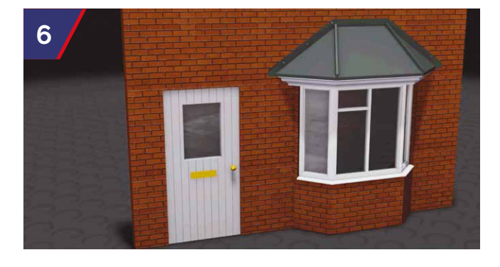
The bay window roof must be over flashed with lead flashing to the Lead Associations recommendations and on exposed sites a bead of sealant/lead adhesive is applied to avoid lifting the flashing.