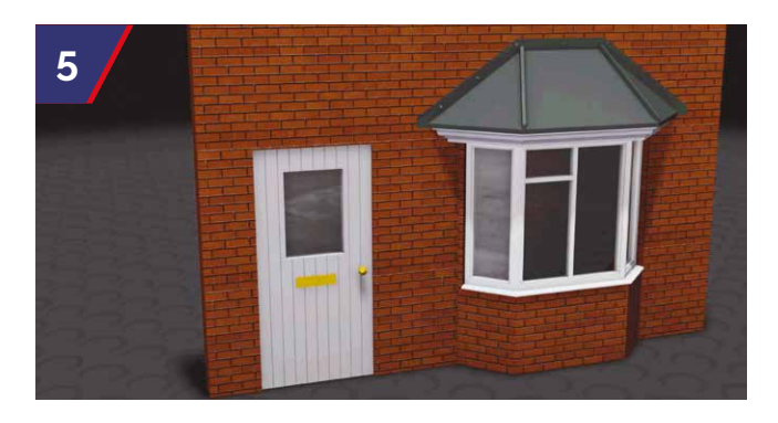
The window head is fixed to the GRP soffit using window manufacturers recommended fixings and sealed with suitable mastic joint.