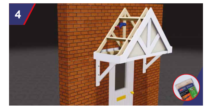
Insert StormFix Blue Frame Fixing sleeve 120 into the drilled holes.