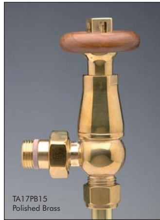
TA17PB15 Polished Brass