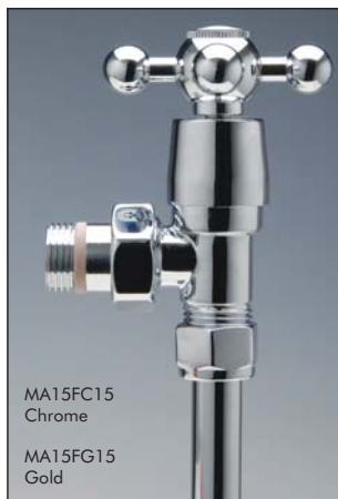
MA15FC15 Chrome MA15FG15 Gold