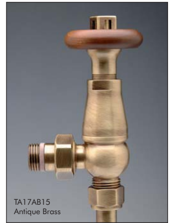
TA17AB15 Antique Brass