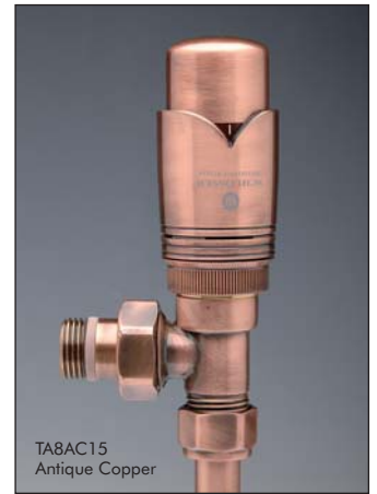
TA8AC15 Antique Copper