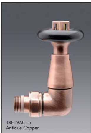
TRE19AC15 Antique Copper