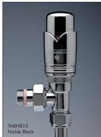
TA8NB15 Nickle Black