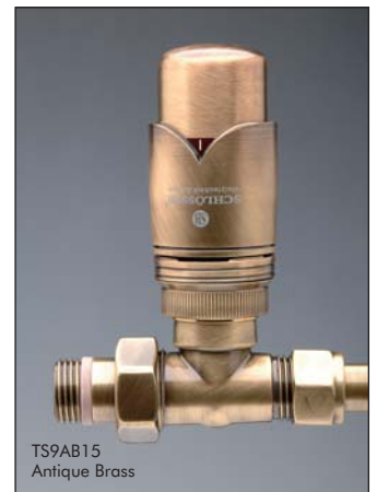
TS9AB15 Antique Brass