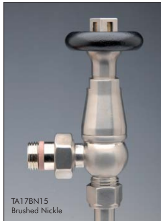
TA17BN15 Brushed Nickel