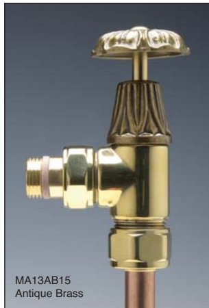
MA13AB15 Antique Brass