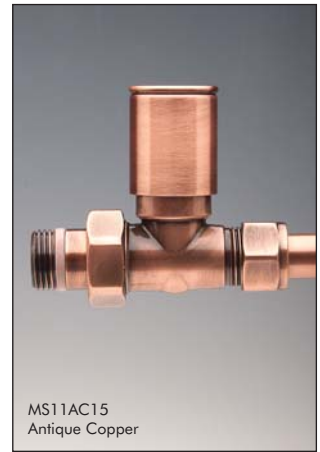
MS11AC15 Antique Copper