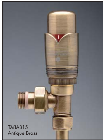
TA8AB15 Antique Brass