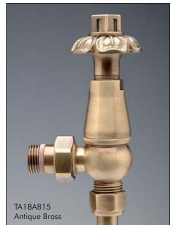
TA18AB15 Antique Brass