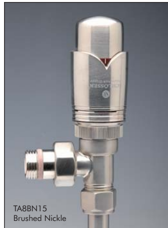
TA8BN15 Brushed Nickel