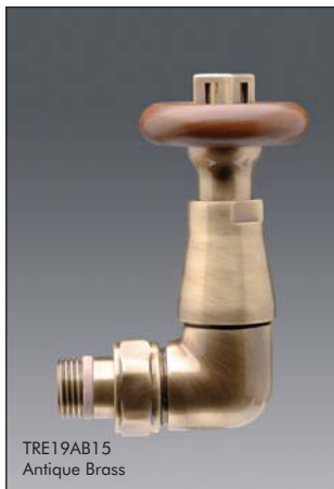
TRE19AB15 Antique Brass