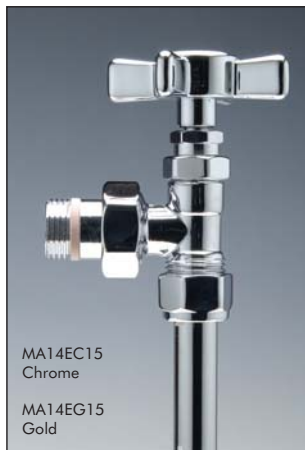
MA14EC15 Chrome MA14EG15 Gold