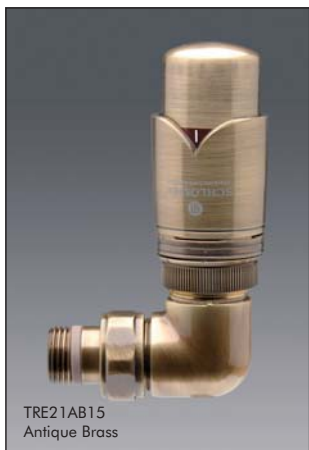
TRE21AB15 Antique Brass