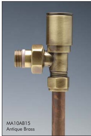
MA10AB15 Antique Brass