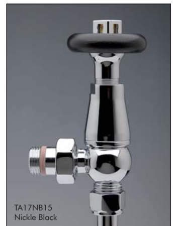
TA17NB15 Nickel Black

When ordering valve sets please check that the correct product codes are used, preferably with a description.