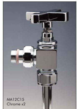
MA12C15 Chrome x2