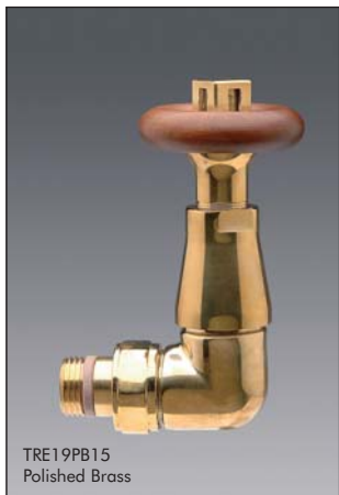
TRE19PB15 Polished Brass