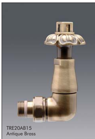
TRE20AB15 Antique Brass