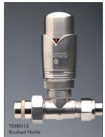
TS9BN15 Brushed Nickel

When ordering valve sets please check that the correct product codes are used, preferably with a description.