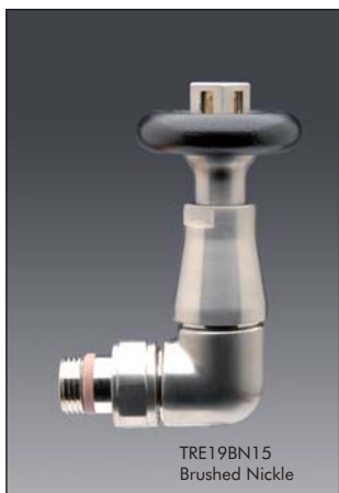
TRE19BN15 Brushed Nickel