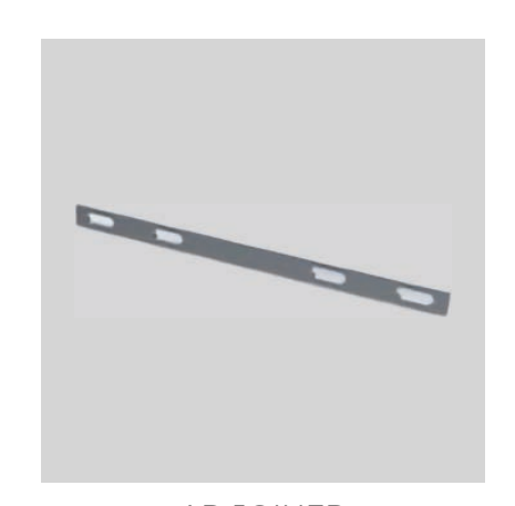
AR-JOINER For 180° joist connection