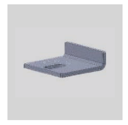
U-STOP Edge restraint for maintaining a 10mm gap around the perimeter