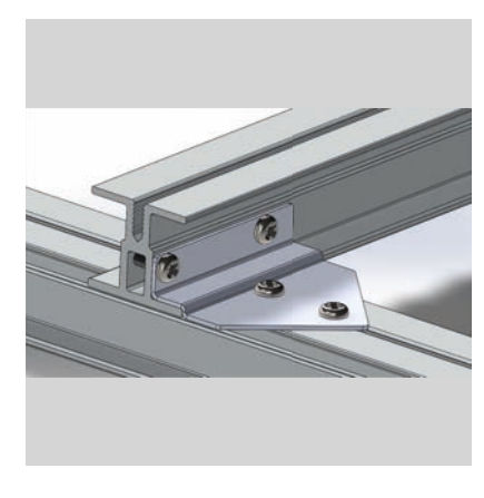
AR-CONNECTOR For stacked joists