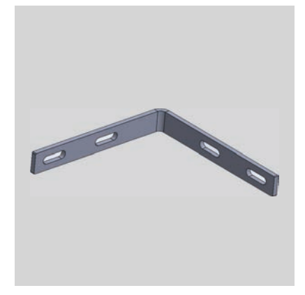
AR-BRACKET For 90° joist connection