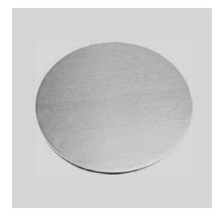
U-PLATE-150 3mm Spreader Plate for use with insulation or waterproof membranes