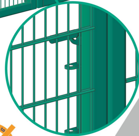
Padlockable Drop Bolt Detail