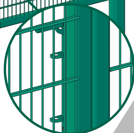
Padlockable Drop Bolt Detail