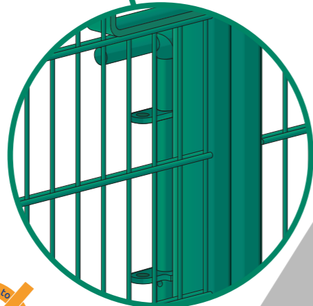
Padlockable Drop Bolt Detail