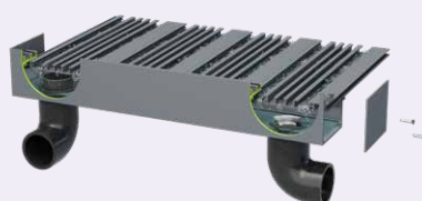
SOFFIT LEVEL PIPED