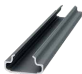
JUNIOR DRAINAGE CHANNEL