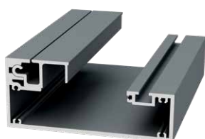
JUNIOR OR SENIOR WIDE ACCESS GUTTERS