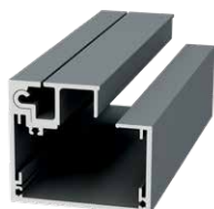
JUNIOR OR SENIOR ACCESS GUTTERS

Access gutters and drainage channels can be used with all of our decking and joist solutions!