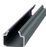
SENIOR DRAINAGE CHANNEL