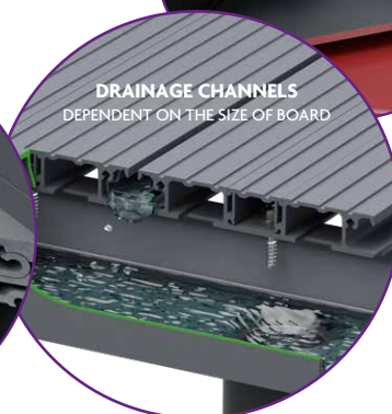
DRAINAGE CHANNELS DEPENDENT ON THE SIZE OF BOARD

Europa & Jenner House Victory Park 1-2 Trident Close Medway City Estate Rochester ME2 4ER