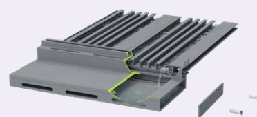
SOFFIT LEVEL EDGE