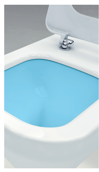
AquaBlade® Technology ensures 100% of the surface area below the channel is rinsed clean.