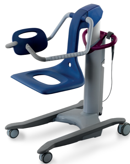
Designed with Albert, Barbara and Carl in mind

Designed for active to semi-dependent residents and patients, the Alenti® bath lift chair provides a comfortable sitting and reclining position. Alenti features a small footprint, is easy to manoeuvre and can be docked from either side of the bath tub. Alenti can also be used for additional essential hygiene tasks, such as toileting.