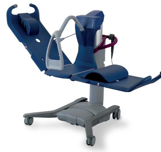
Miranti is compatible with System 2000 baths with System 23 and System 25 lengths. Designed with Doris and Emma in mind

The Miranti® powered bath lift trolley ensures a single caregiver can position a dependent resident or patient into a reclining position for a relaxed bathing experience.