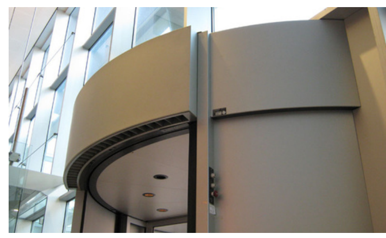
Boon Edam Air Curtains