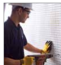
Newton waterproof membranes are the highest quality available

Newtons product range continues to grow to encompass products to deal with all aspects of commercial and domestic structural waterproofing, damp proofing and packaged sump and pump stations