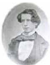
John Newton circa 1848