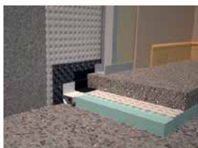
A typical technical drawing of Newton System 500 being applied to a structure