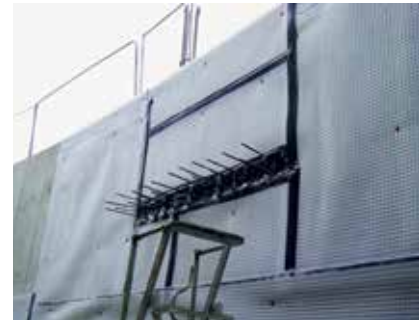
Newton 508 is one of the most frequently specified cavity drain membranes in the UK

The NSBC offered a 20-year guarantee and the property is completely protected against water ingress.