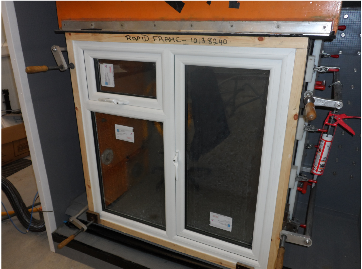
Photo of sample