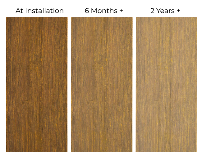
Ageing scale depending on maintenance & exposure