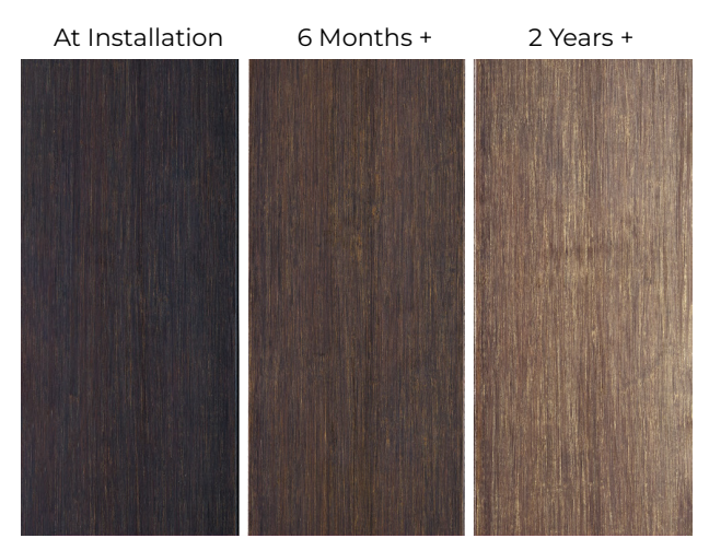
Ageing scale depending on maintenance & exposure