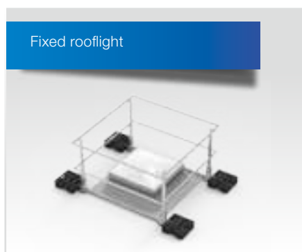
Standard fencing for rooflights with a skylight function.