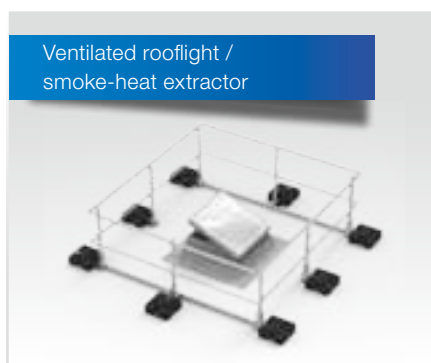
Variable sizes with sufficient free space for opening rooflights and smoke-heat extractors.