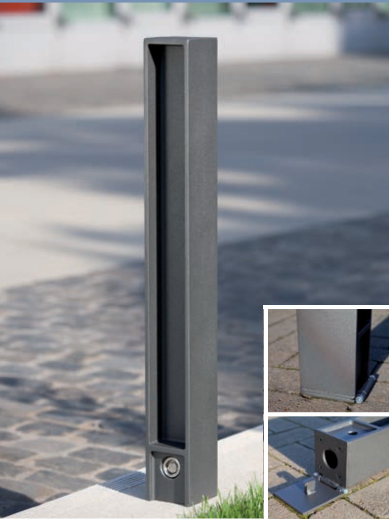
Colour: DB 703. Inset: hinged version