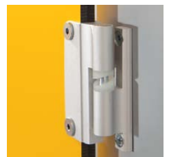
Hidden Safety Hinge