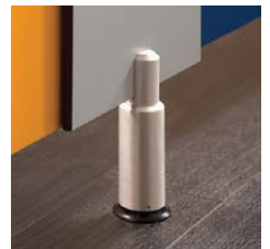
Wide Base Cubicle Leg