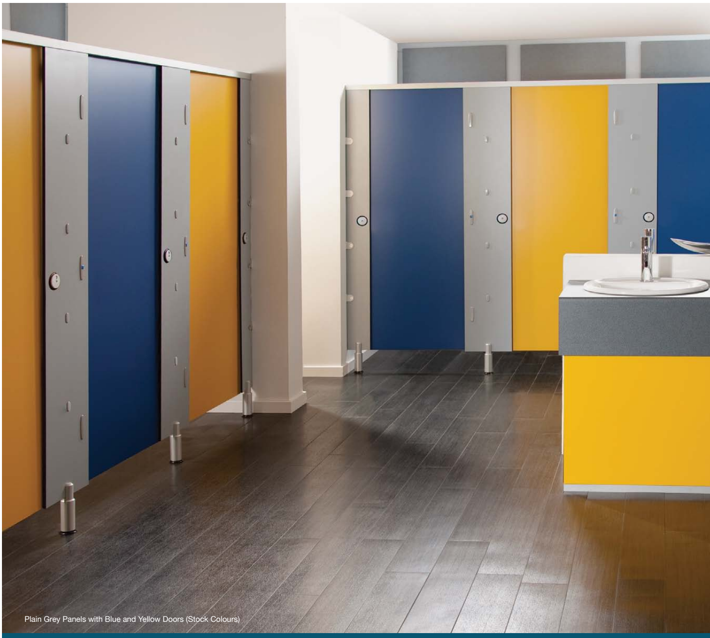
Plain Grey Panels with Blue and Yellow Doors (Stock Colours)