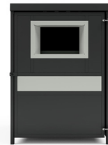
WEE Equipment Recycling