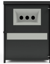
Individual Item- Hole