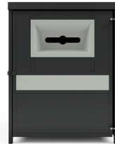
Individual Item- Mixed