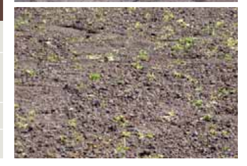
'Based on our experience with DELTA®-TERRAXX to date, we may say that the material sets new standards for protection and drainage systems.'