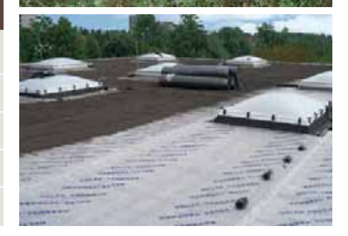
under the sheets. Motivated by this positive experience, the contractor has been successfully using DELTA®-TERRAXX in other projects since then.