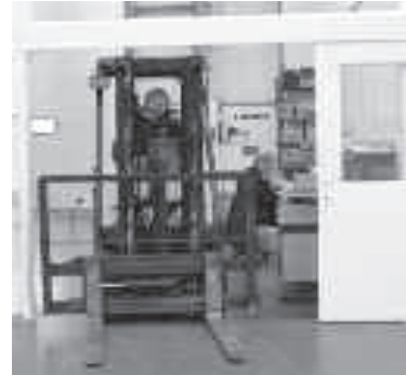
Blinds can be integrated in double glazed panels.

Elan sliding doors provide an aesthetic solution for areas which require access from large vehicles.