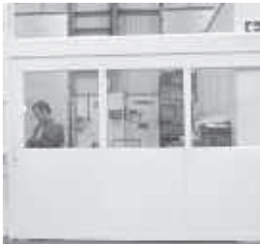
Elan panels have the option of a fire rated version which has been tested to BS476: part 22: 1987

Elan sliding doors provide all the benefits of a large access door while maintaining the aesthetics of a high class double skin partition.