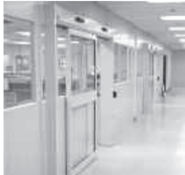
Elan has been designed with the facility to run wires / data cables through the panel / panel joints and floor track.

Elan sliding doors are very popular for areas which have heavy traffic but also need to look professional.