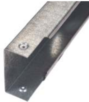
Dimple - Punched hole for screw and recess for screw head