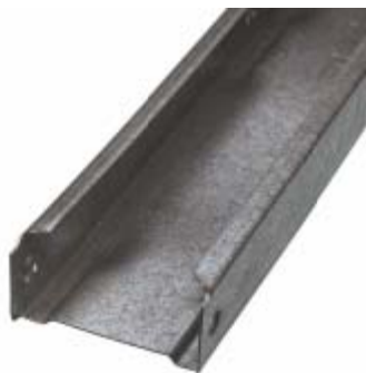
Swage - Crimps the product undersize to allow through intersections