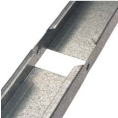
Web Notch - Punches away the web to allow through intersections