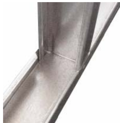
Crimp Cut Off - Cuts the product to length and crimps the end to allow a load bearing connection