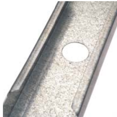
Service Hole - Up to Ø32mm wiring or plumbing hole.