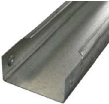
Lip Notch - Punches away the lip to allow T or through intersections