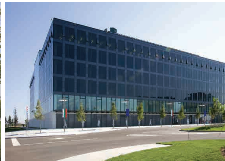
BULGARIA SOFIA, AIRPORT CENTER - STOPRAY TITANIUM 37T AND IPLUS ENERGY N - CIGLER MARANI ARCHITECTS - LEED GOLD

For more information please consult AGC's yearly sustainability report on www.agc-glass.eu/en/sustainability or send your questions and/or suggestions by email to the Sustainability & Product Stewardship department at sustainability@eu.agc.com .