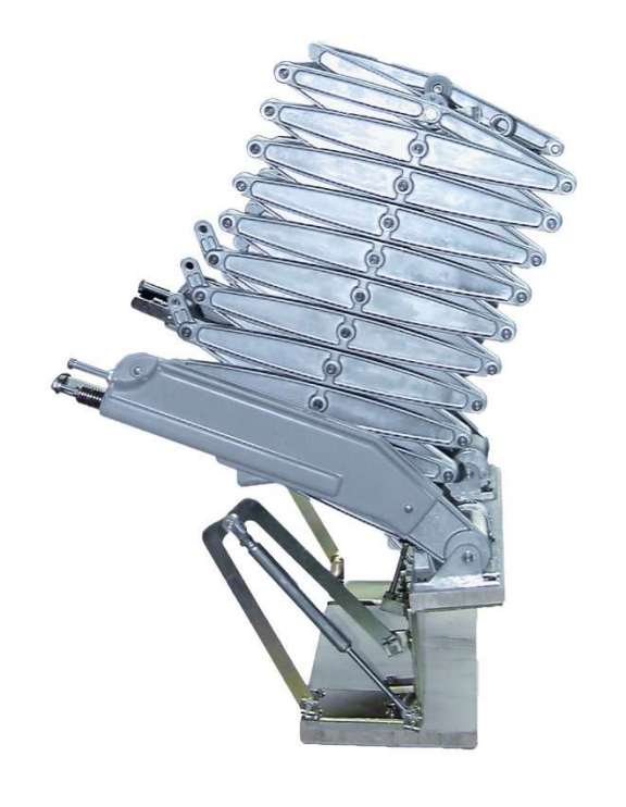
Space-saving retractable (concertina) ladder mechanism, shown here with an optional hinge for installation on mezzanine floors or within vertical hatches

Warranty: 2-year full warranty and 10-year parts warranty