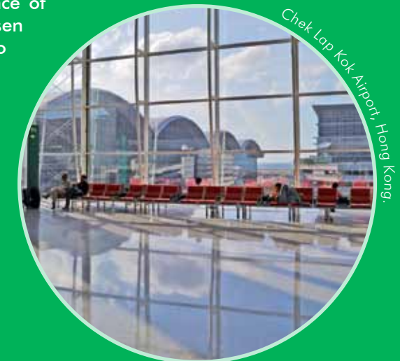
Chek Lap Kok Airport, Hong Kong.

Isocrete K-Screed can be machine-applied using a revolutionary technique that has seen enormous improvements to health and safety issues involved in flooring projects. Taking the pressure off the backs and joints of floor screeders, the Isocrete K-Master machine delivers a safer, flatter subfloor installed up to four times faster than traditional methods.