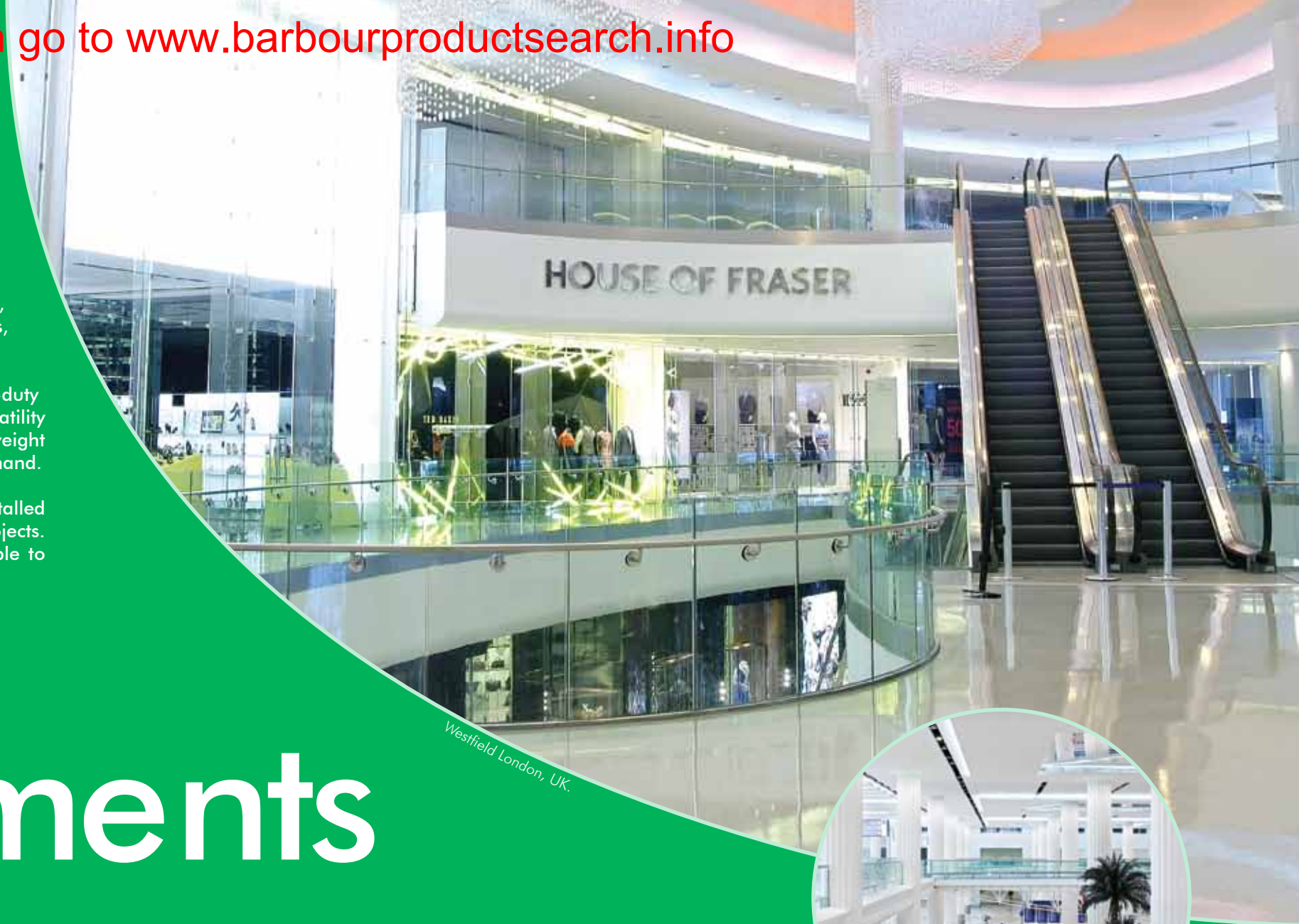
Westfield London, UK.