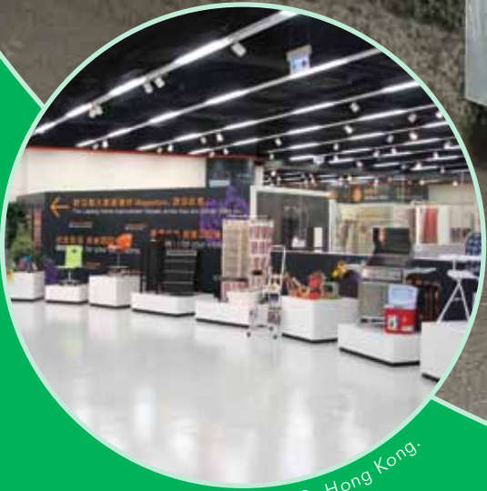
B&Q, Hong Kong.