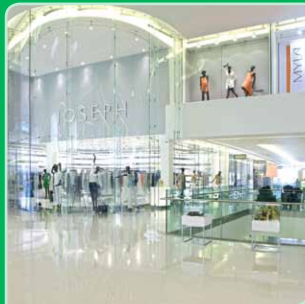
Westfield London, UK.

Flowcrete has been involved in the construction of Europe's biggest ever shopping development, Westfield London, located in the trendy Shepherd's Bush district of West London. The centre houses an atrium for live events, 4,500 parking spaces, 265 shops, 15 restaurants, a cinema as well as other leisure facilities.