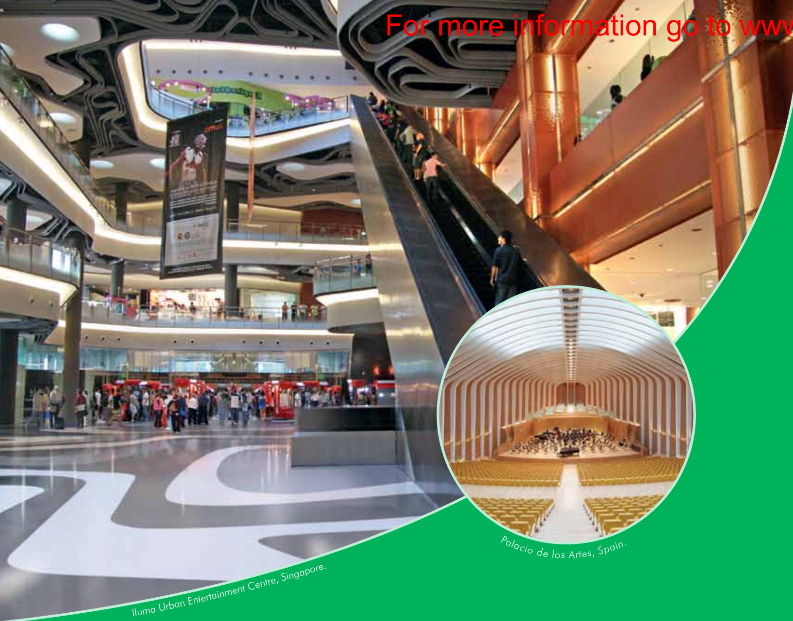
Iluma Urban Entertainment Centre, Singapore.