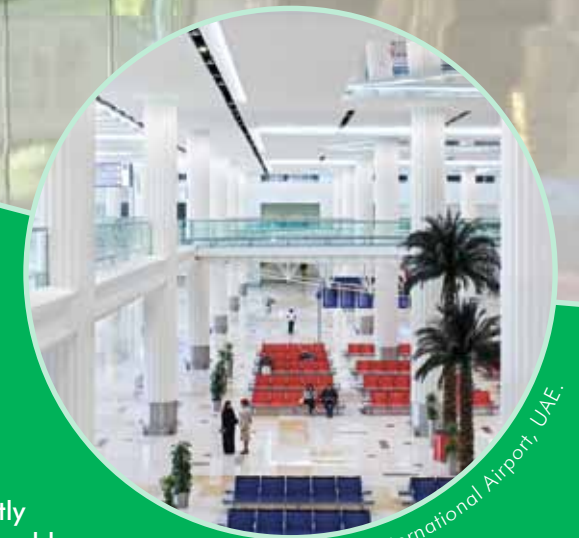
Dubai International Airport, UAE.