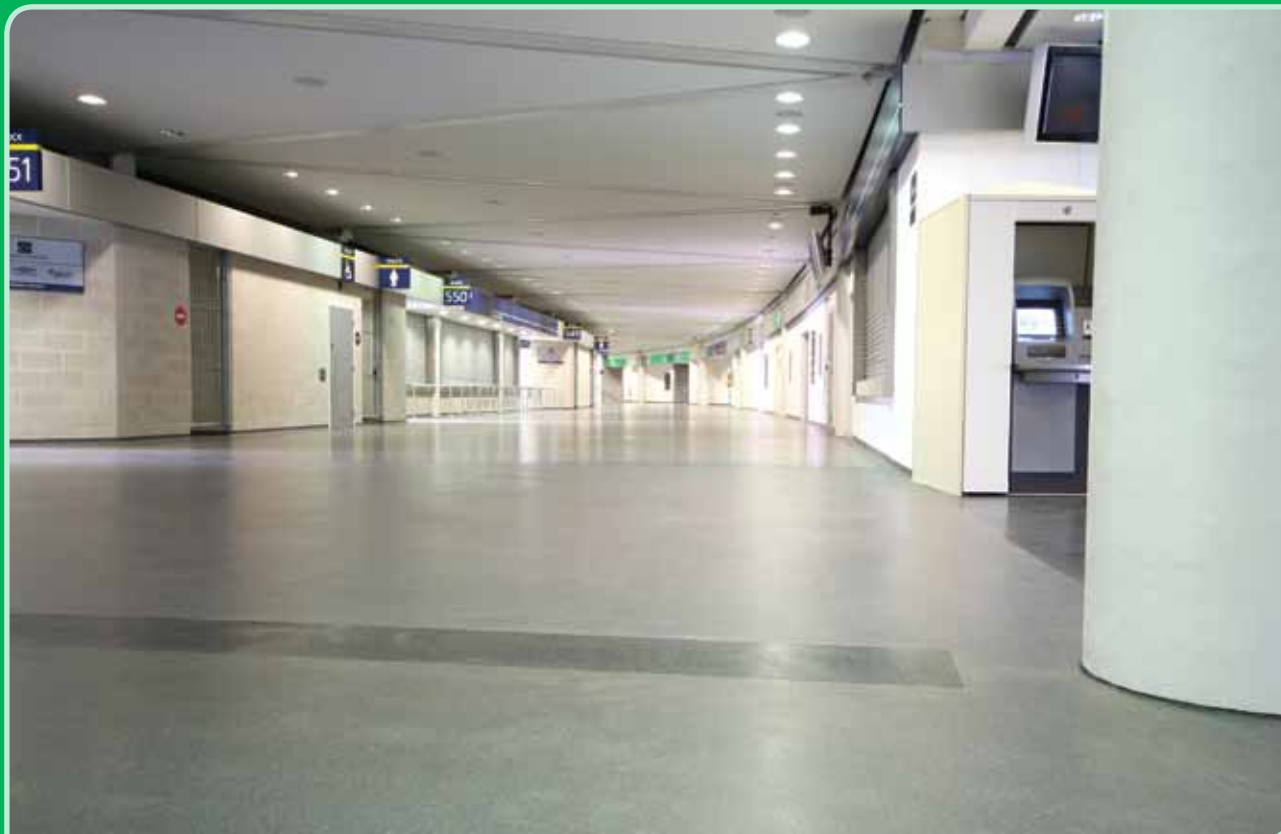
Wembley Stadium, UK.

STRONG - With excellent compressive strengths of over 30N/mm 2 compared to the 15-20N/mm 2 achieved by typical sand and cement screeds, Isocrete K-Screed is ideal for use in environments subject to high volumes of foot traffic. Correctly installed and covered by a suitable floor finish, the system should have a life cycle equal to that of the building itself.