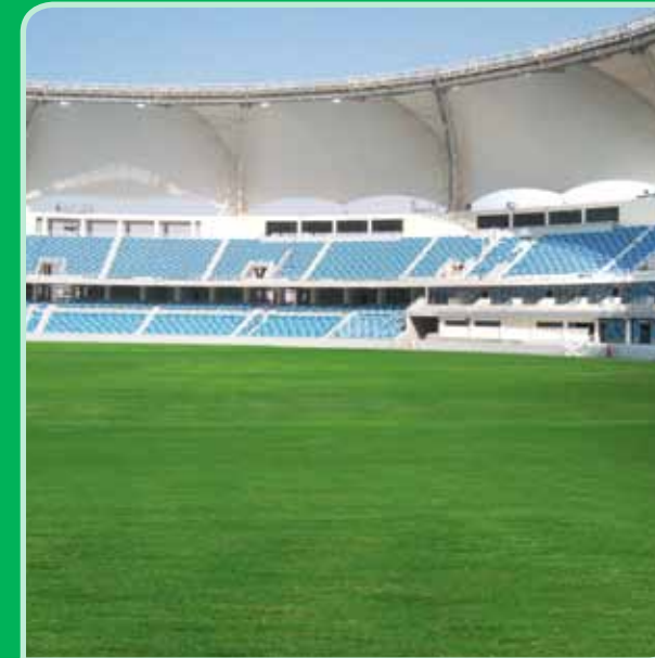
Sports City Cricket Stadium, UAE.

Dubai finally took its place on the world cricket stage as the first Twenty20 Tournament to be held in the UAE played out at the newly constructed Dubai Sports City Cricket Stadium.