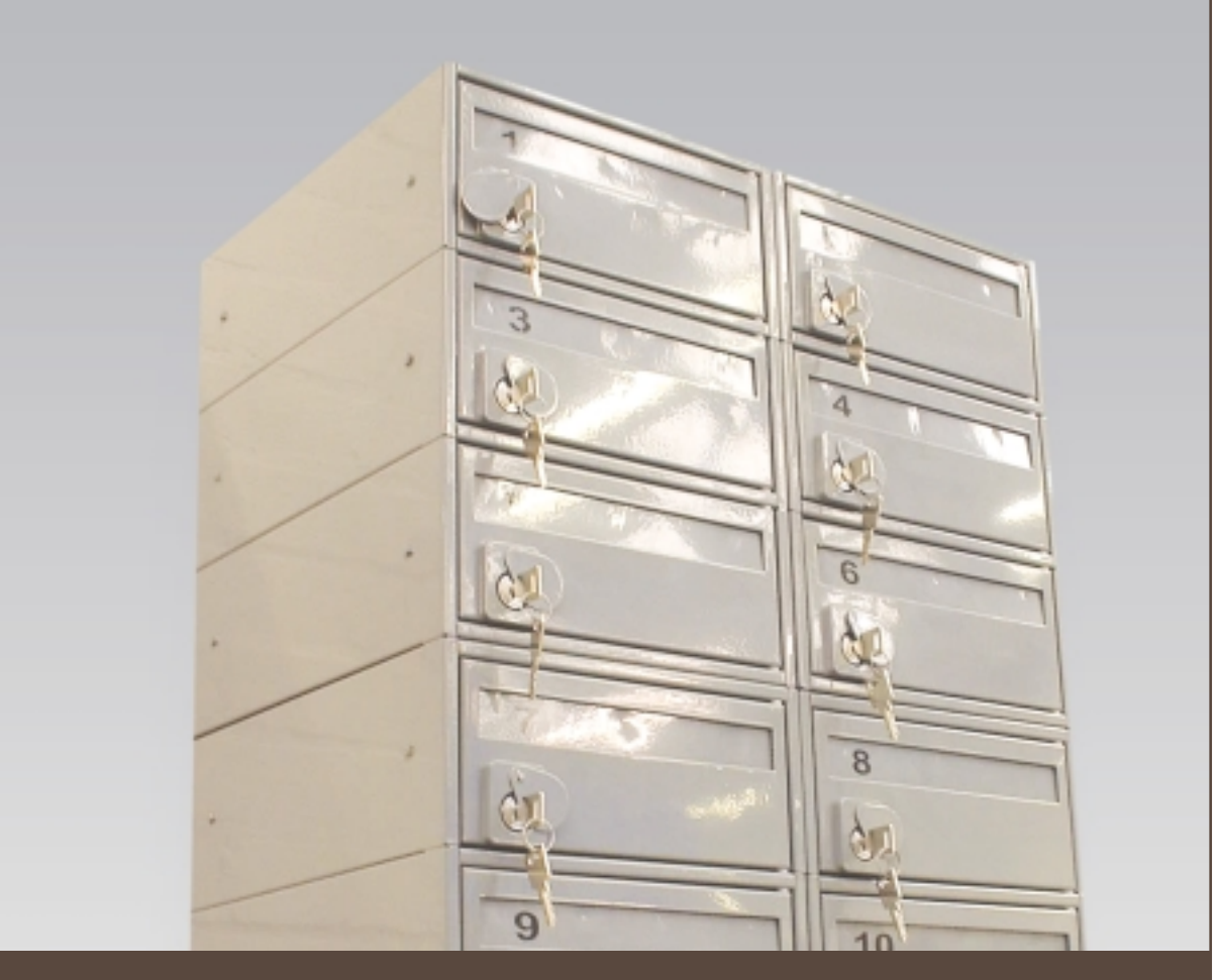
Fire Rated Mailboxes