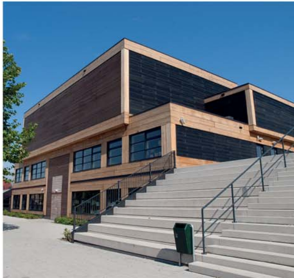
External timber Fire Retardant