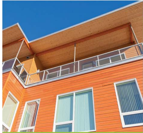
Internal & External Timber Decorative Coatings