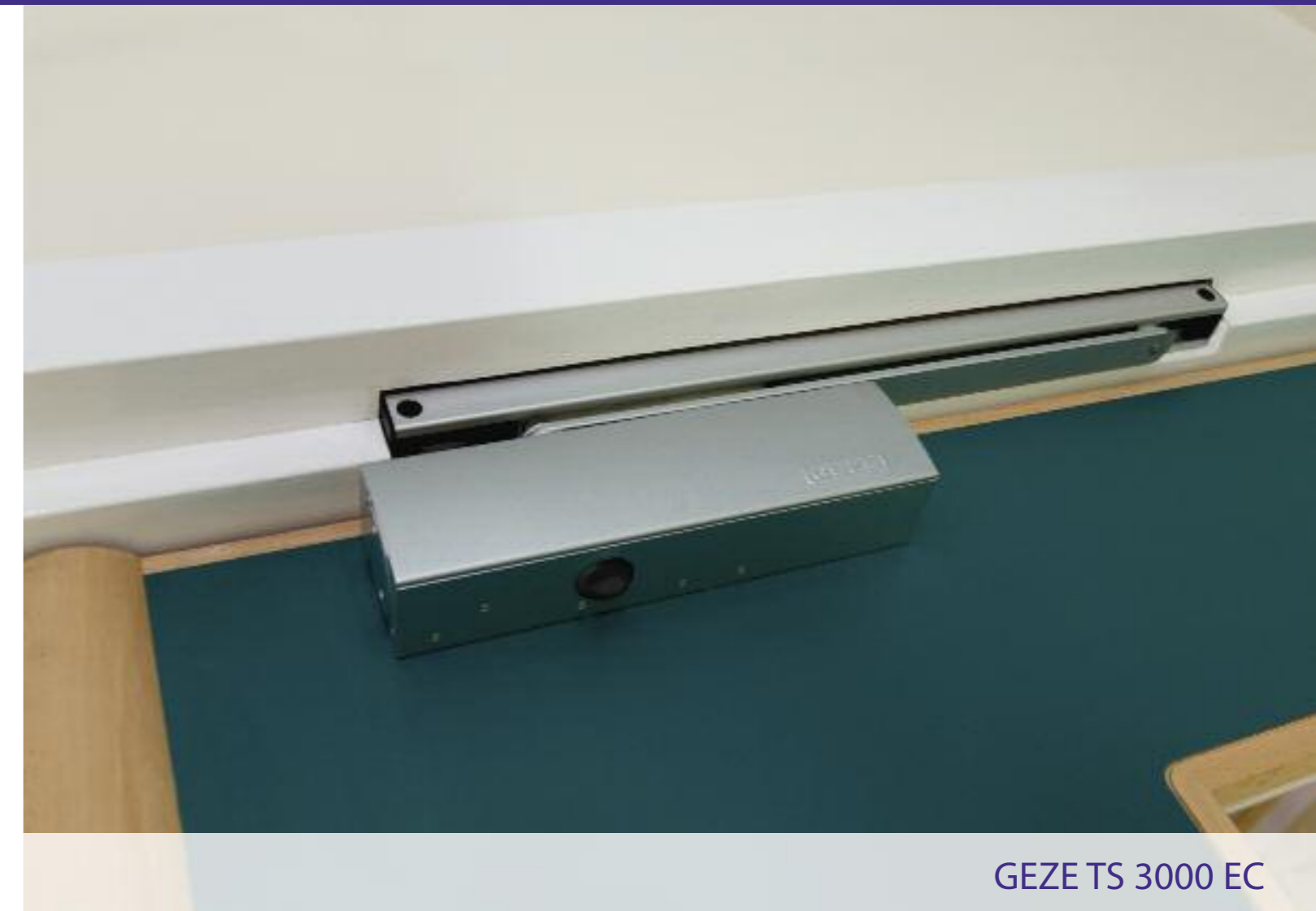
GEZE TS 3000 EC

Tel: 01543 443000 Fax: 01543 443001 Email: info.uk@geze.com Website: www.geze.co.uk