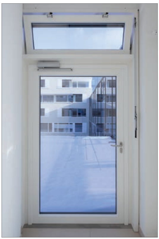
GEZETS 5000 and OL 90 N with post-rail transmission, Nursing home Augustinum, Stuttgart, Germany