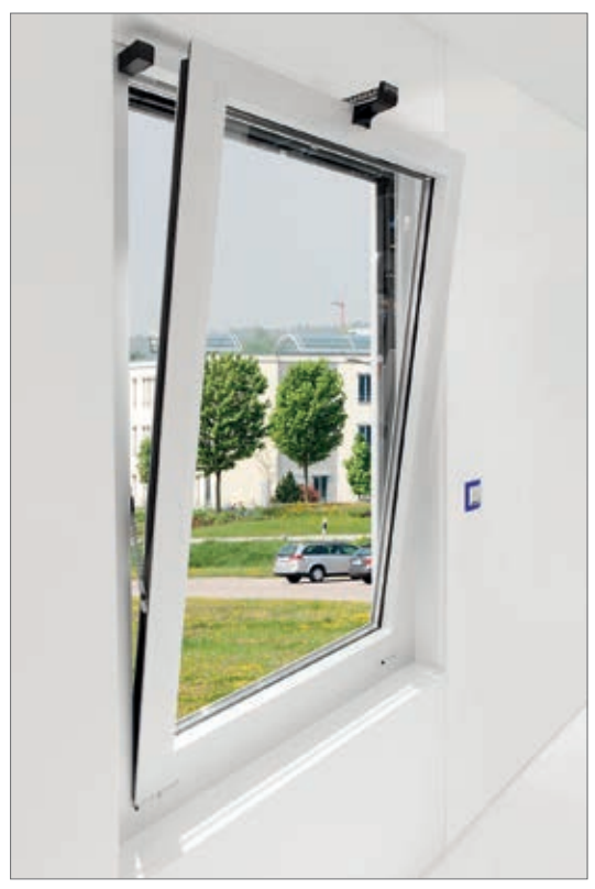
GEZE Powerchain with safety scissors