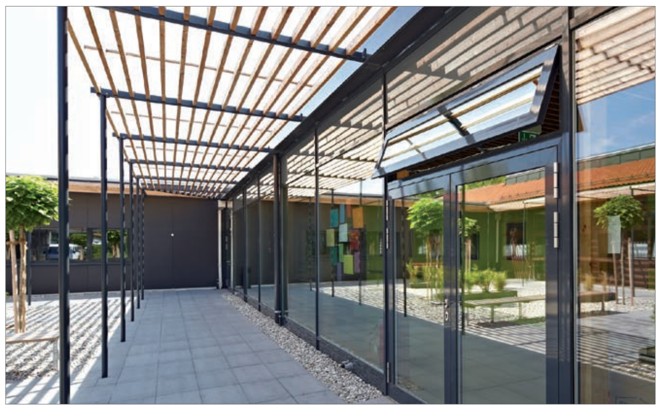
GEZE OL 90 top-hung, outward opening, Stiftung Ecksberg, Mühldorf, Germany