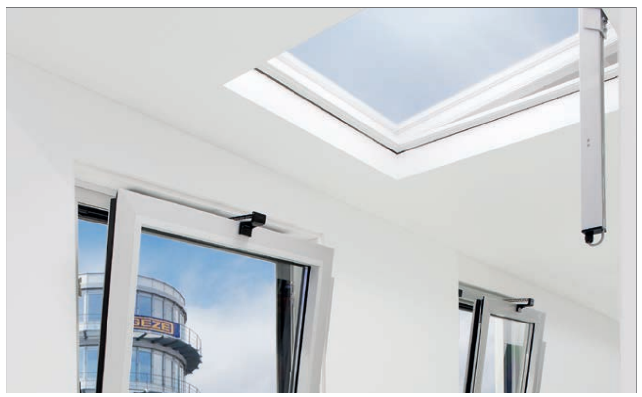
GEZE Slimchain and GEZE E 250 NT