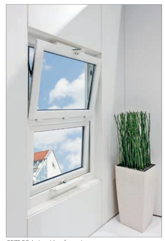
GEZE ECchain with safety scissors