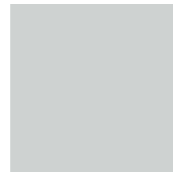
Misty White Ref 5813