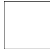
Crisp White* Ref 1000