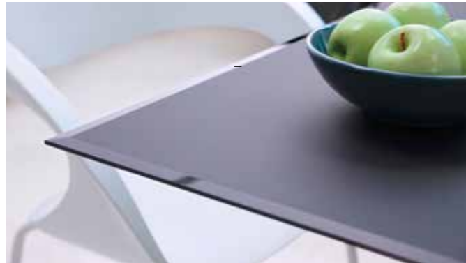
POLAND TABLE TOP, MATELAC T DEEP BLACK

Other exterior applications – Outdoor furniture, exterior partitions