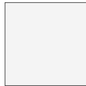
Cool White Ref 1502