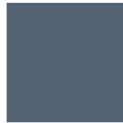
Zen Grey Ref 6005