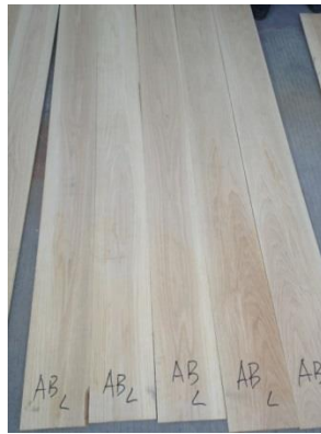
AB grade Lighter Tones