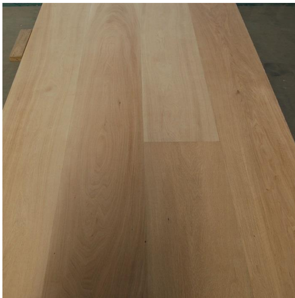
This is ABC Select Grade Russian Oak