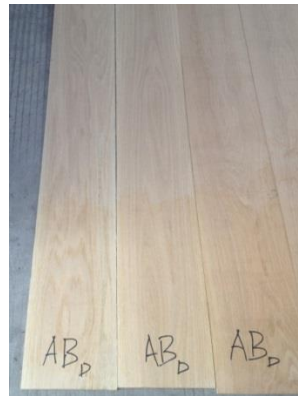
AB Grade Darker Tones