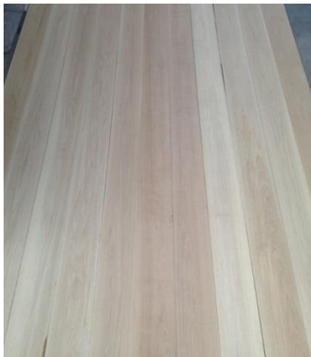
Raw Material Before Selection

CDEF: large colour variation, larger live and dead knots, splits and shakes we make all our antique wood flooring from these grades. Some examples of the raw material we get are shown below: