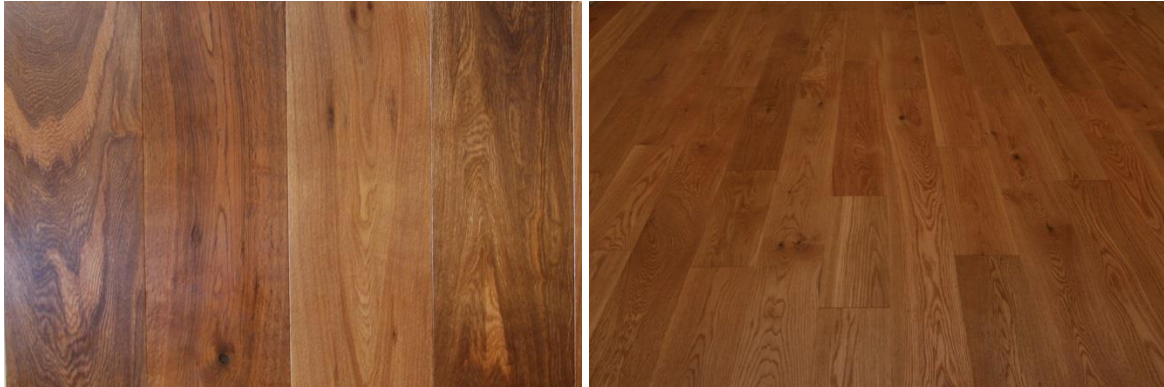
This shows the colour variation in an ABCD mix grade which has been fumed

White Oak from the northern regions of North America North Asia and Siberia in Russia grow very slowly so grain and colour variation is more regular and cleaner than European Oak which grows much faster. It also has a lot less knots than European Oak, for example our Select ABC grade would be like a prime European Oak grade or “Grade 1” as we call it.