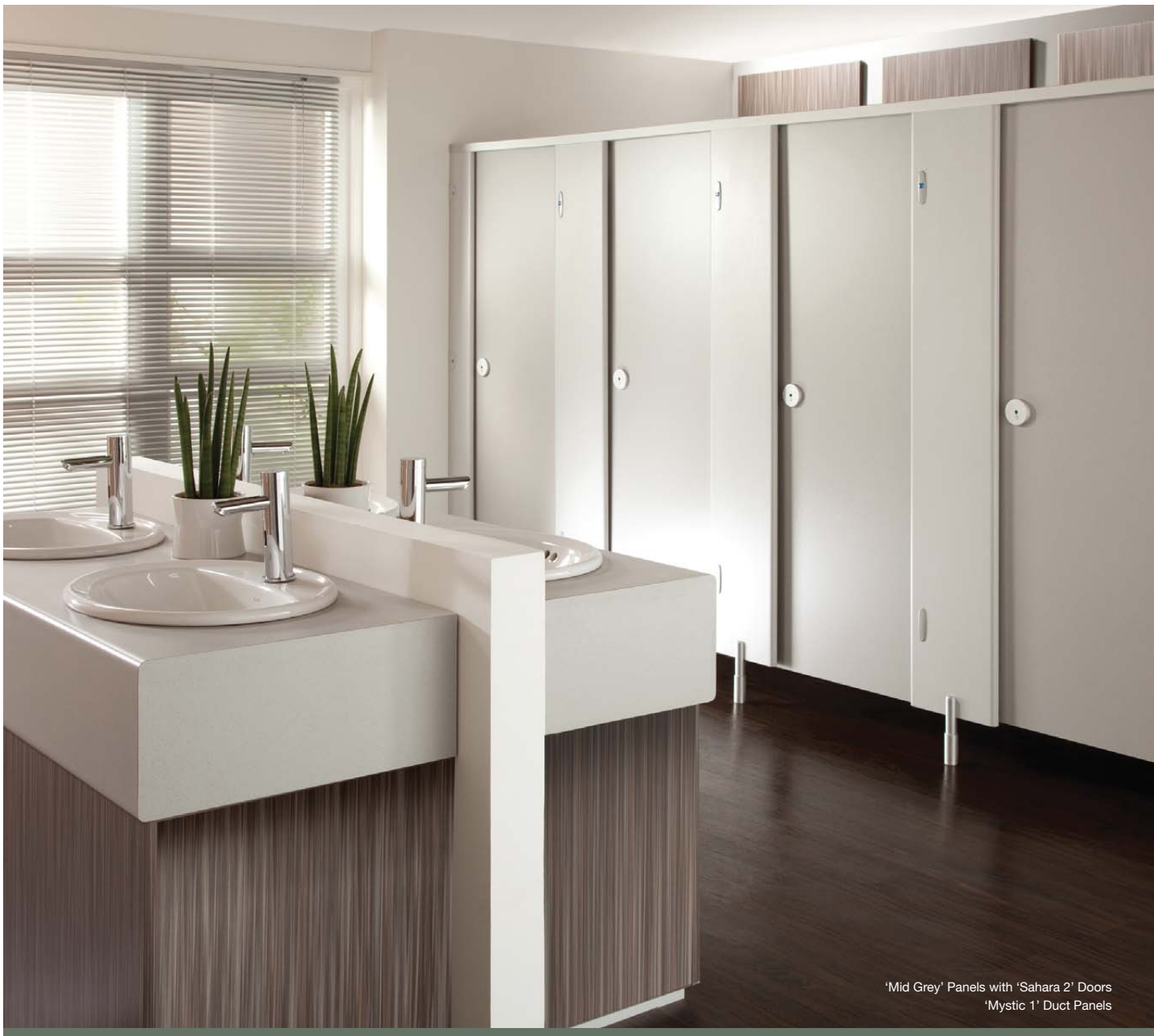
'Mid Grey' Panels with 'Sahara 2' Doors 'Mystic 1' Duct Panels