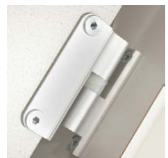
Hidden Safety Hinge