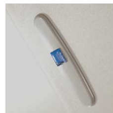
Secure Hinge Face Plate