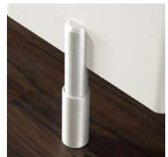
Adjustable Cubicle Leg