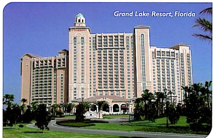
Grand Lake Resort, Florida