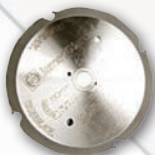
HardieBacker® SAW BLADE

Cutting of boards can be performed by scoring a line and snapping the board upwards using a straight edge.