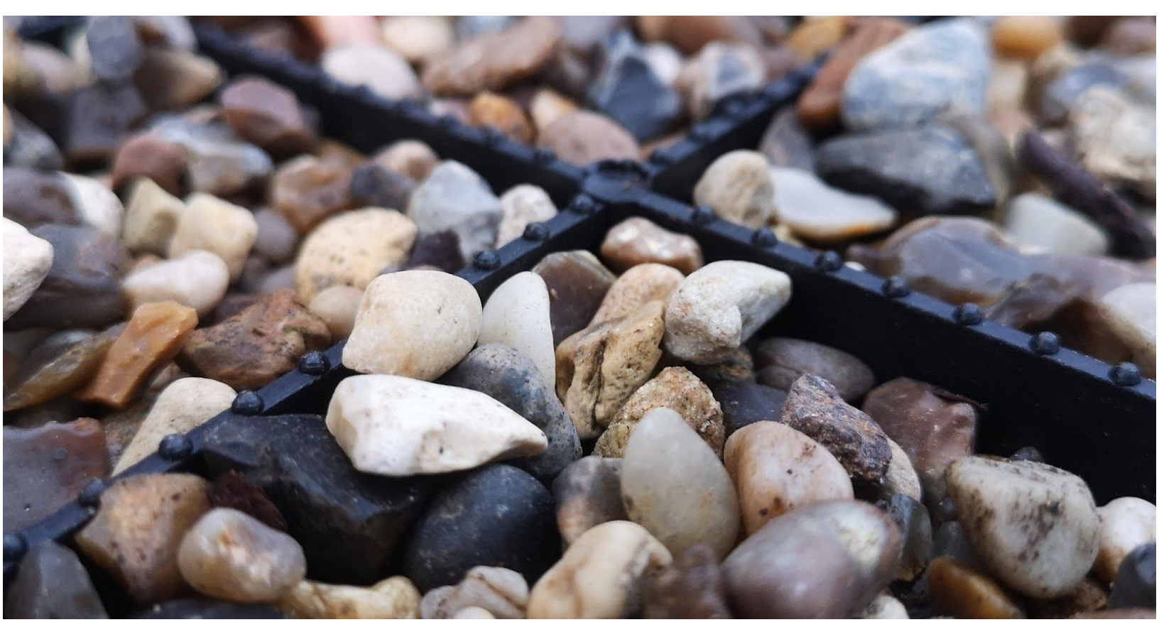
IBRAN permeable gravel retention grids