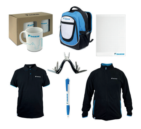
Free corporate merchandise pack available when you go online