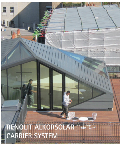
RENOLIT ALKORSOLAR CARRIER SYSTEM