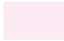
Ruby S 304 [12 mm]