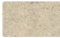
Almond Pearl G 08 [12/9/6 mm]