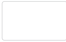
Alpine White S 28 [12/9/6 mm]

From elegant to extravagant, classic to ultra-contemporary.