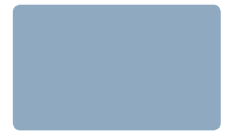
Sky Blue S 203 [12 mm]