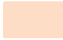
Apricot S 04 [12 mm]