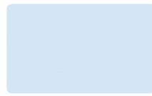
Sapphire S 303 [12 mm]