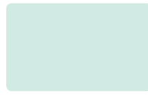
Venus Green S 204 [12/9/6 mm]