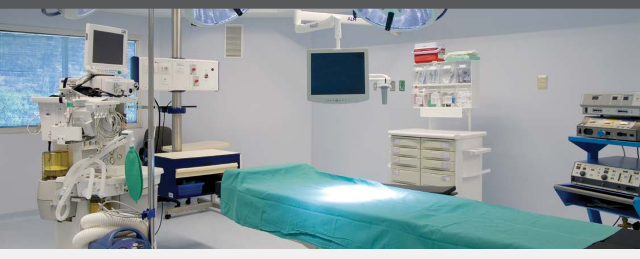
Product - The right environment