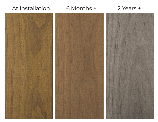
Ageing scale depending on maintenance & exposure